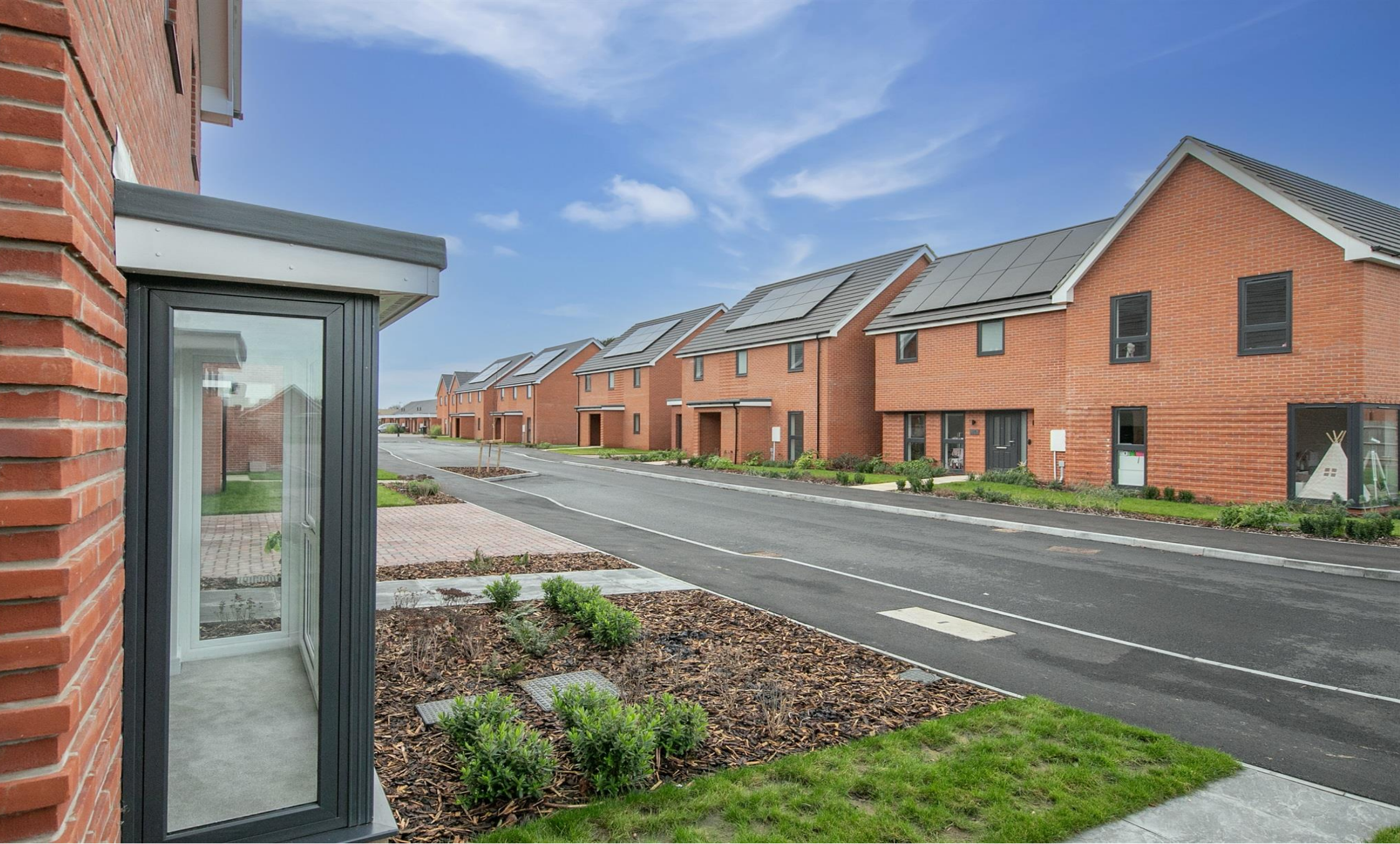
Phase 3 The Paddocks, Ramsey Road, Ramsey, Harwich CO12 5EW