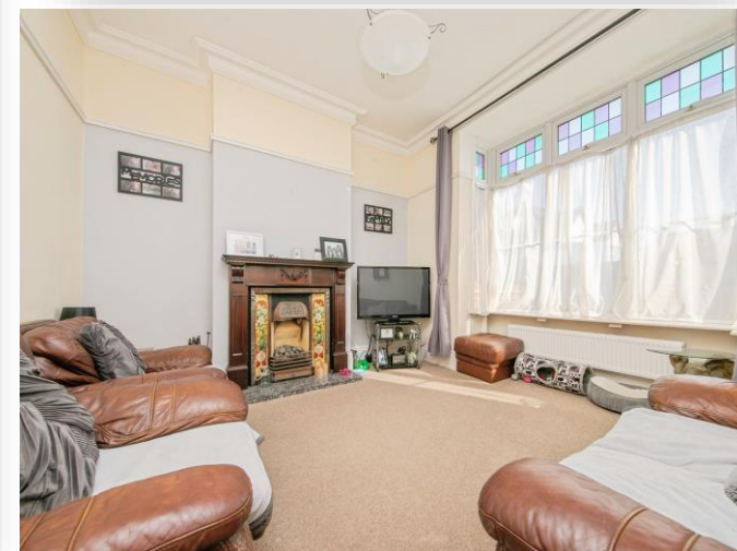
Beach Road, Harwich CO12 3RP