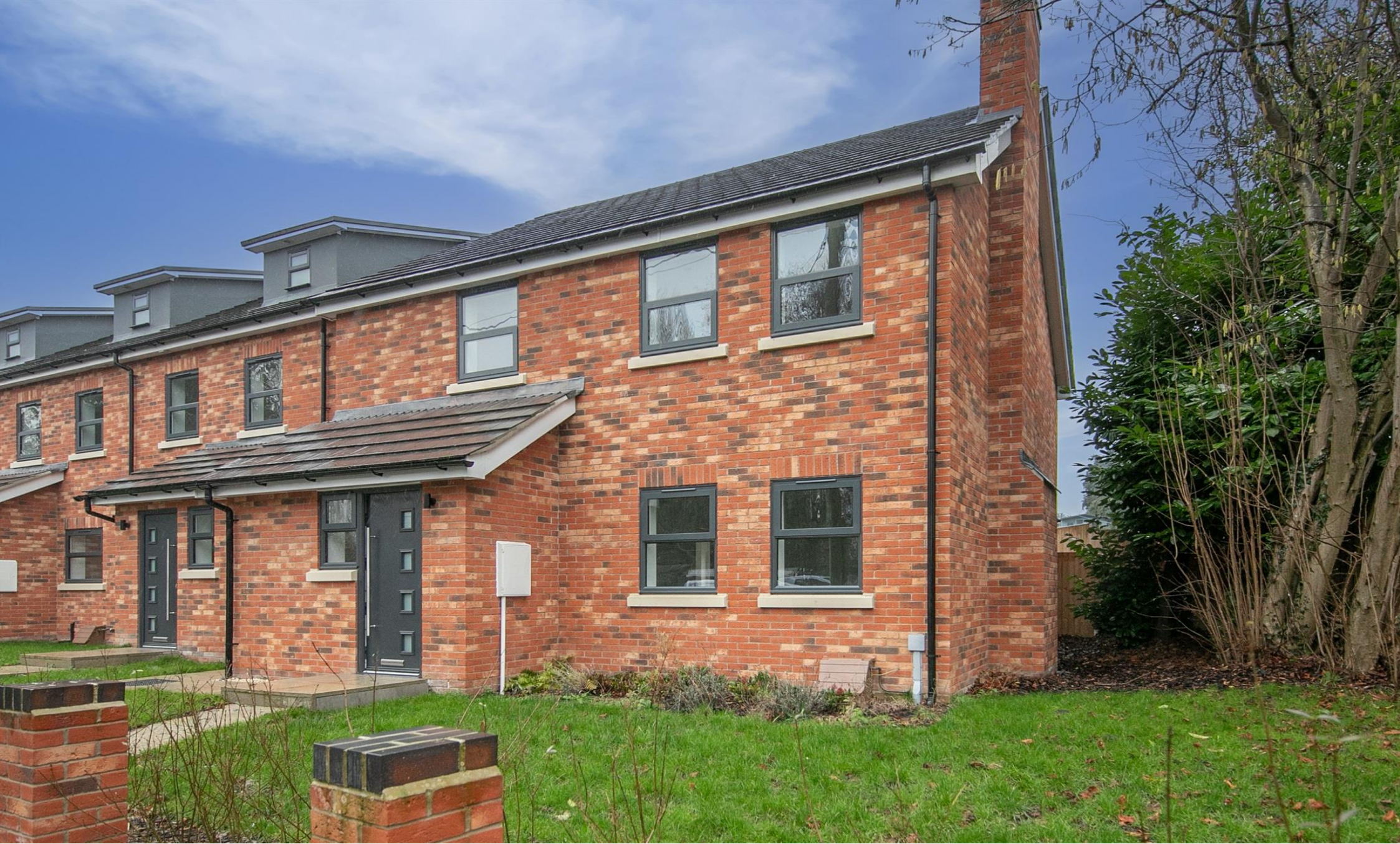
Old School Court, Wix Road, Ramsey, Harwich CO12 5FR