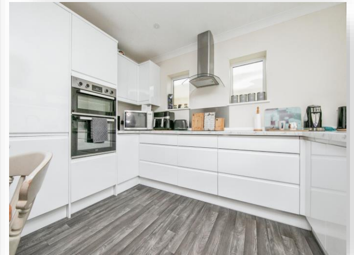
Mayes Lane, Ramsey Harwich CO12 5EL