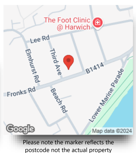
view this property online williamhbrown.co.uk/Property/HAW109347