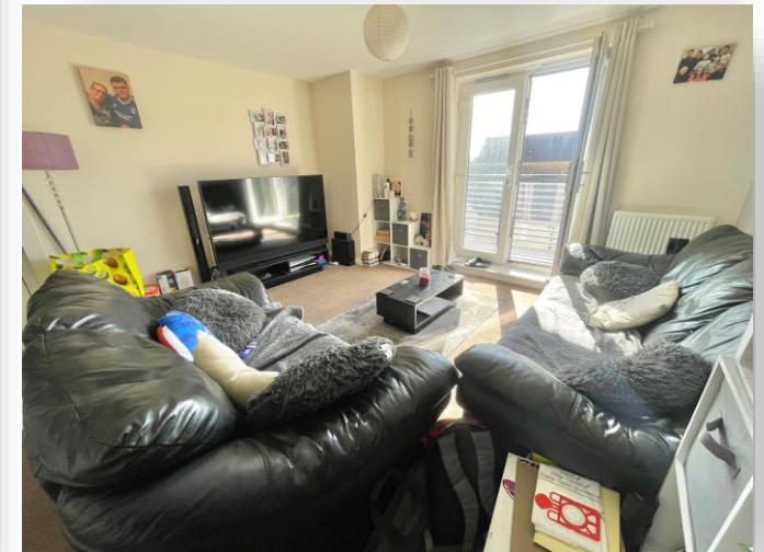
Fulmar House Heron Way, Harwich CO12 3FG