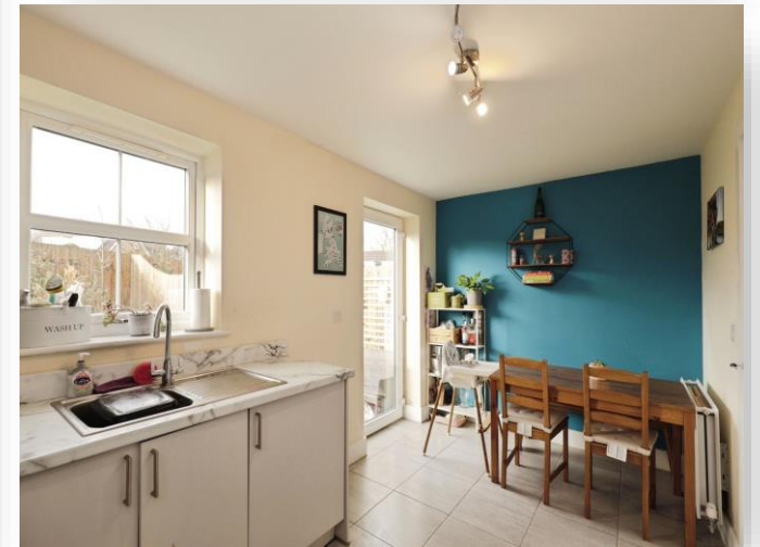
Nidderdale Hill View, Darley HARROGATE HG3 2PA