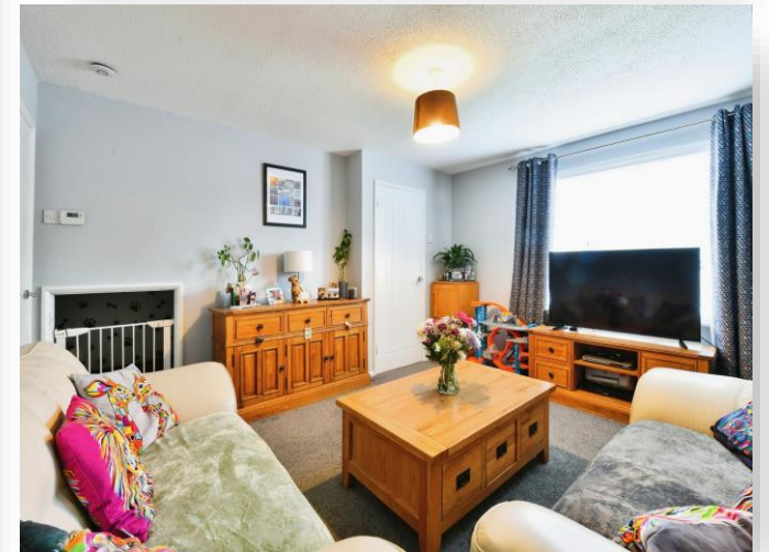
Norwood Grove, Harrogate HG3 2XL