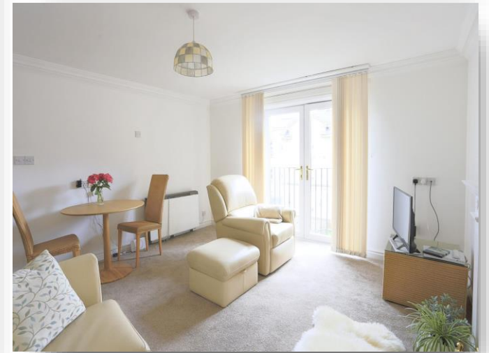
Church Square Mansions Church Square, Harrogate HG1 4SS