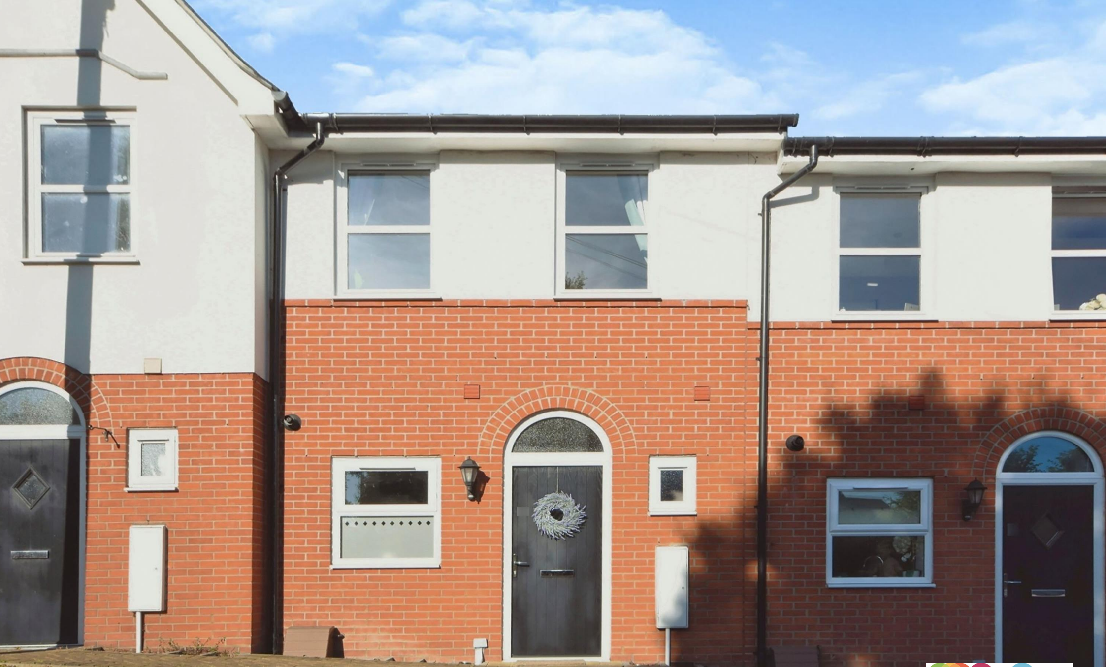
Plaza Close, Sible Hedingham, Halstead, CO9 3FP