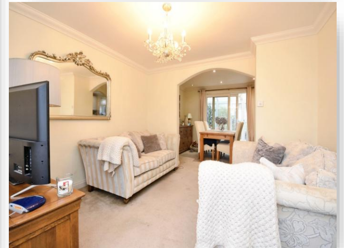
Bowmans Park, Castle Hedingham, HALSTEAD, CO9 3DT