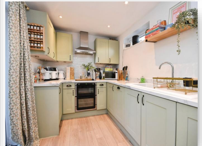
Brook Place, Halstead, CO9 1DG