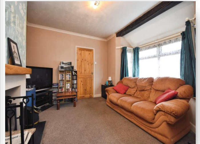
Mill Lane, Colne Engaine, Colchester, CO6 2HY