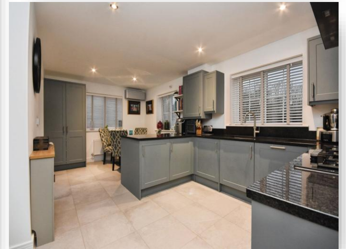
Bourne Brook View, Earls Colne, Colchester, CO6 2FL