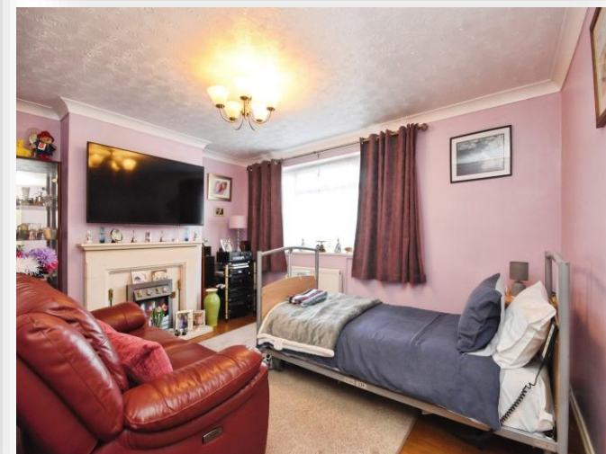
Hawkwood Road, Sible Hedingham, Halstead, CO9 3JR