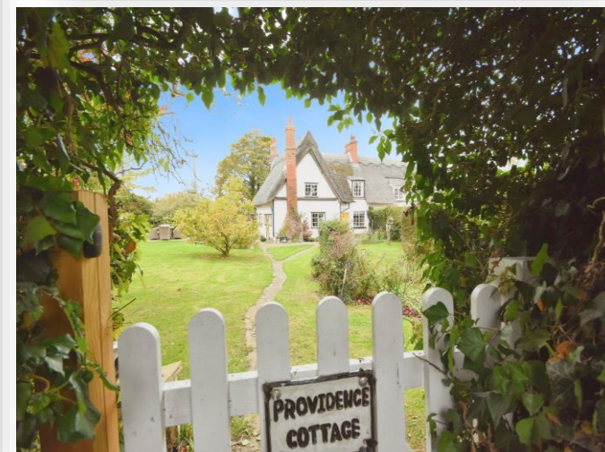
Providence Cottage, Gainsford End, Toppesfield, Halstead, CO9 4EG