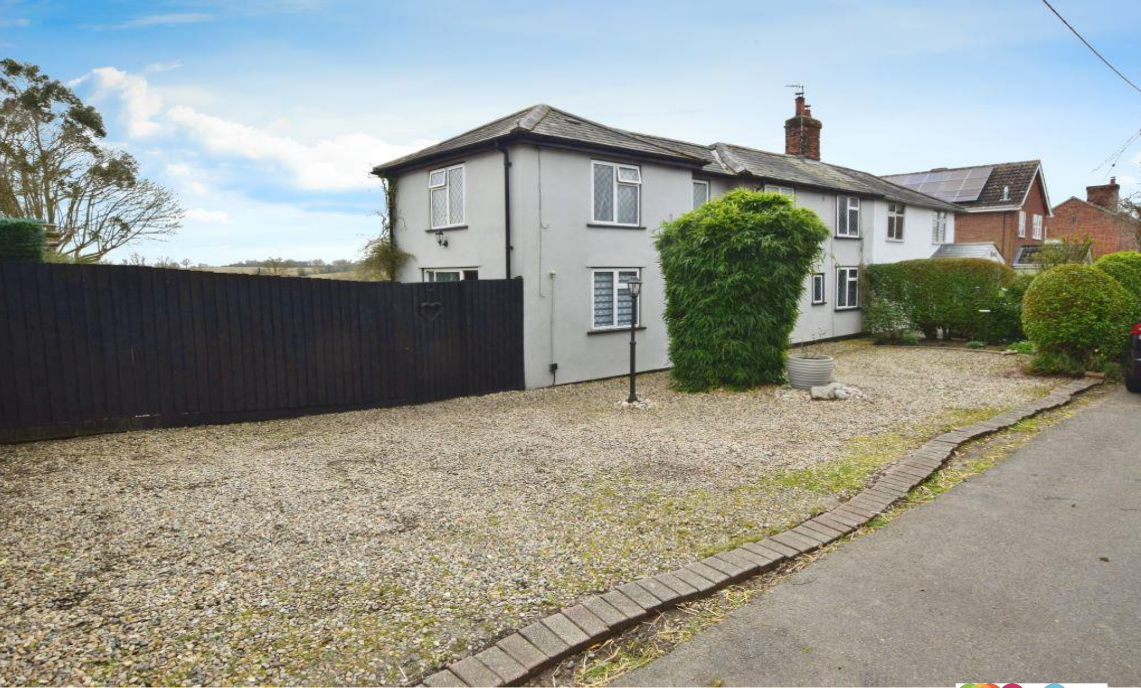
Jasmine Cottage, Chapel End Way, Stambourne, HALSTEAD, CO9 4NZ