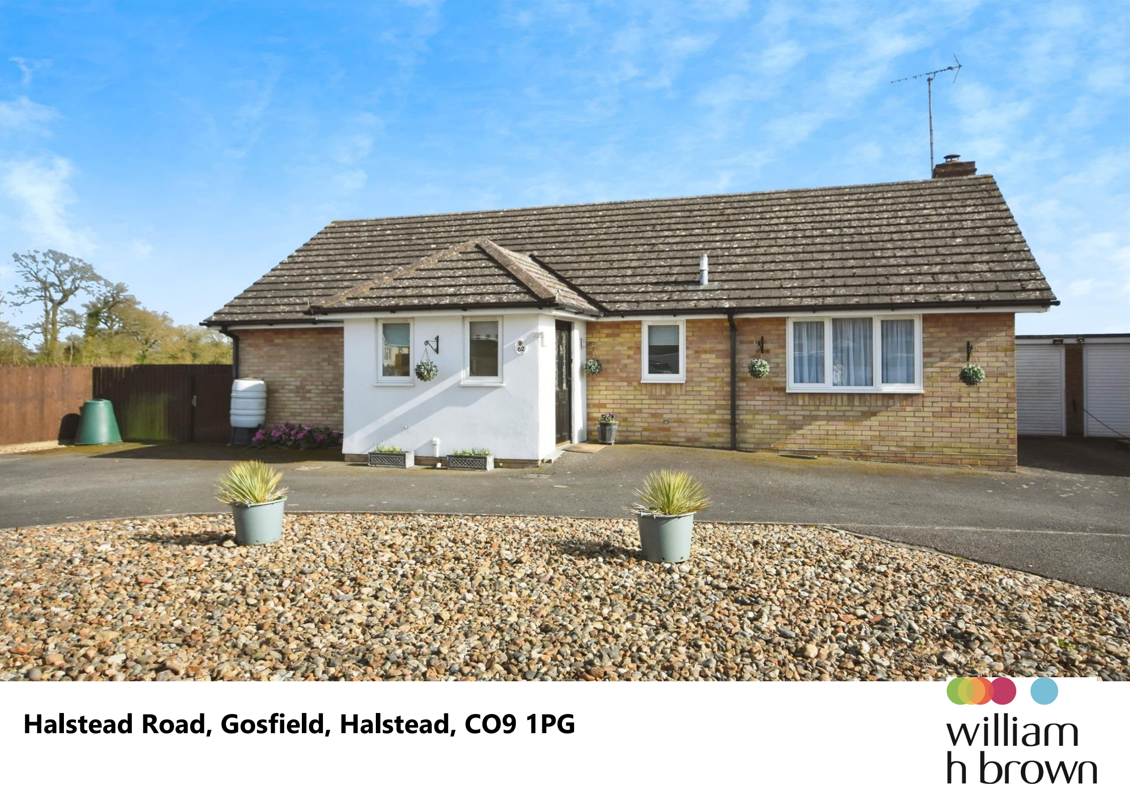
Halstead Road, Gosfield, Halstead, CO9 1PG