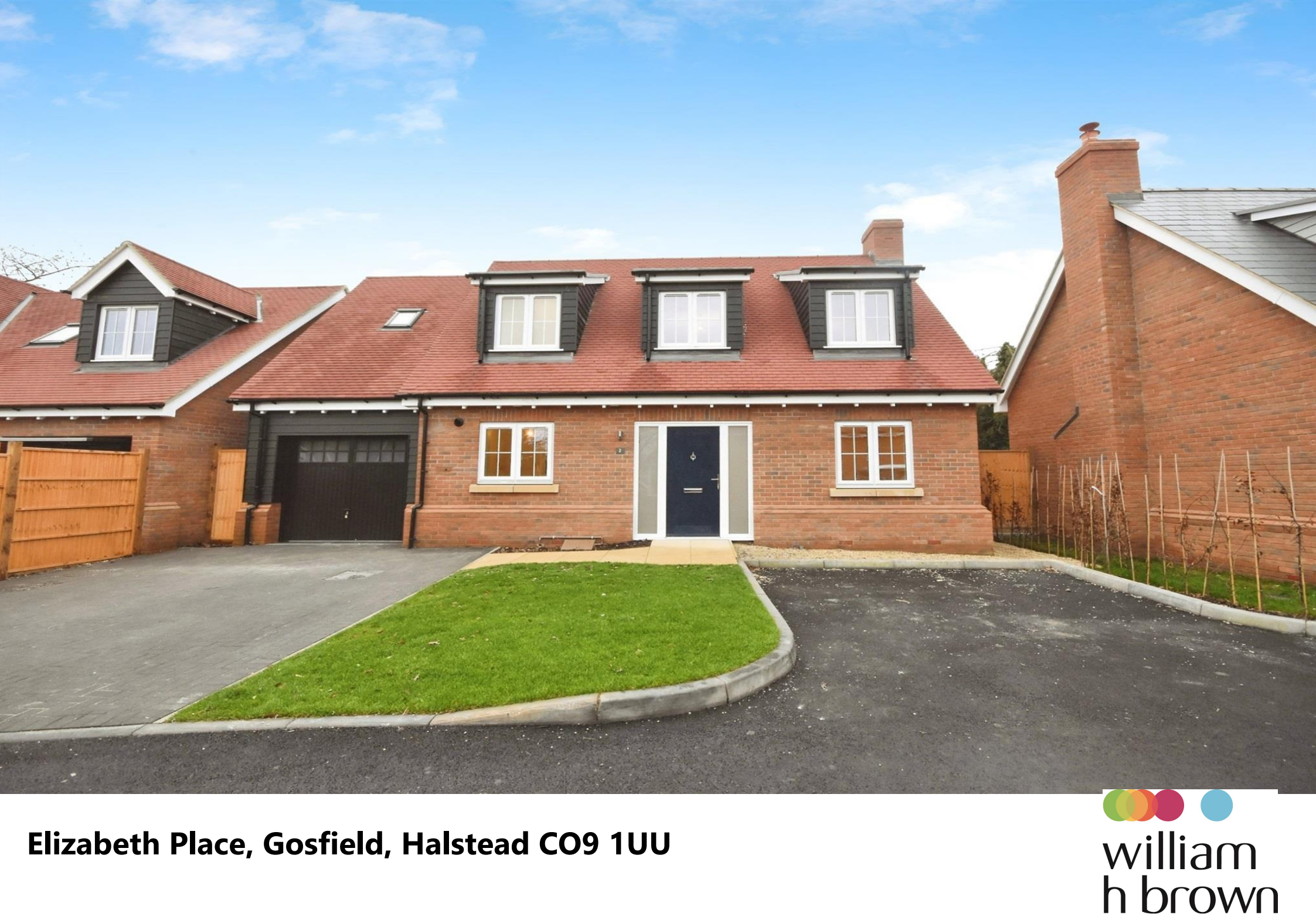
Elizabeth Place, Gosfield, Halstead CO9 1UU