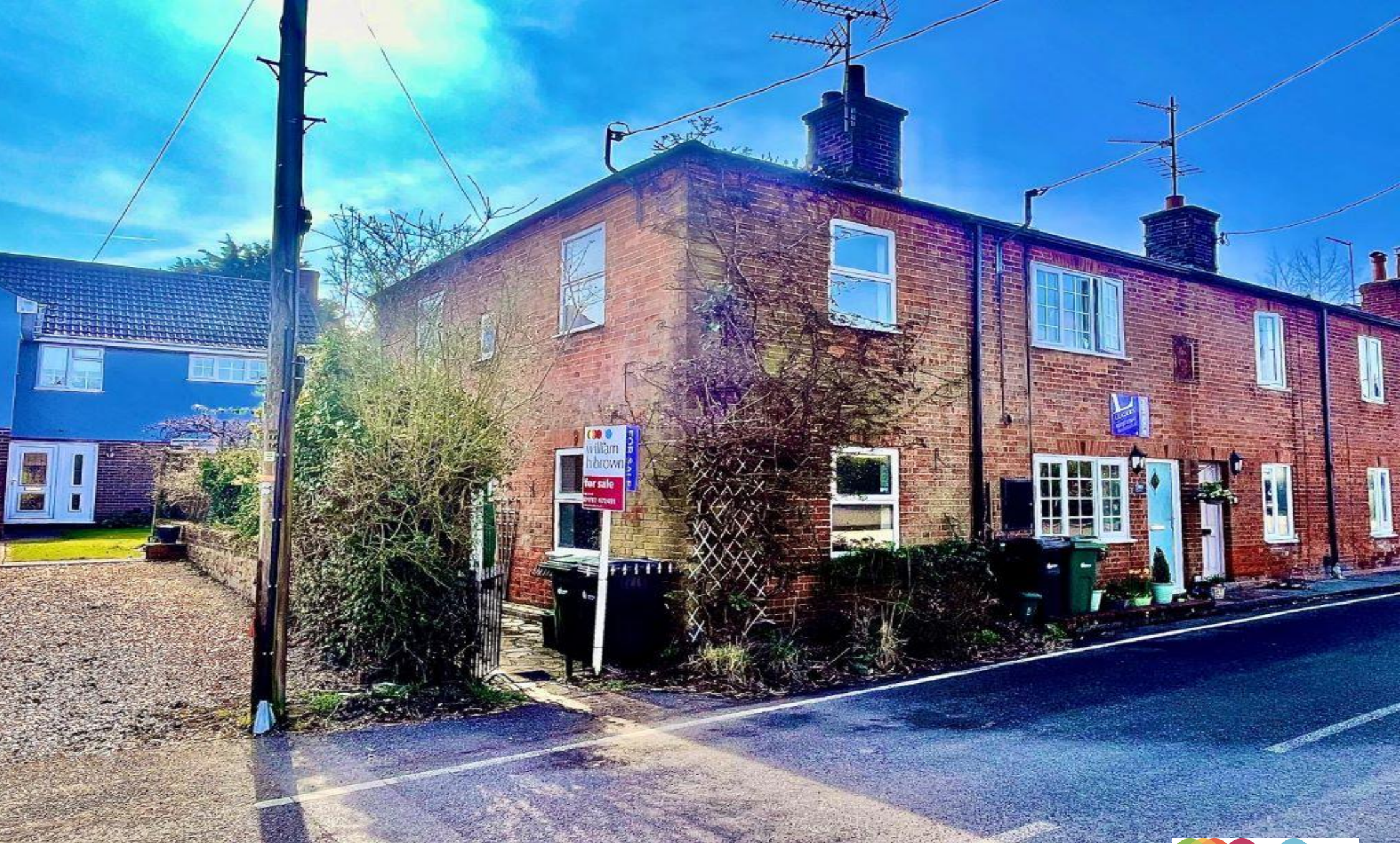
Nunnery Street, Castle Hedingham, Halstead, CO9 3DR