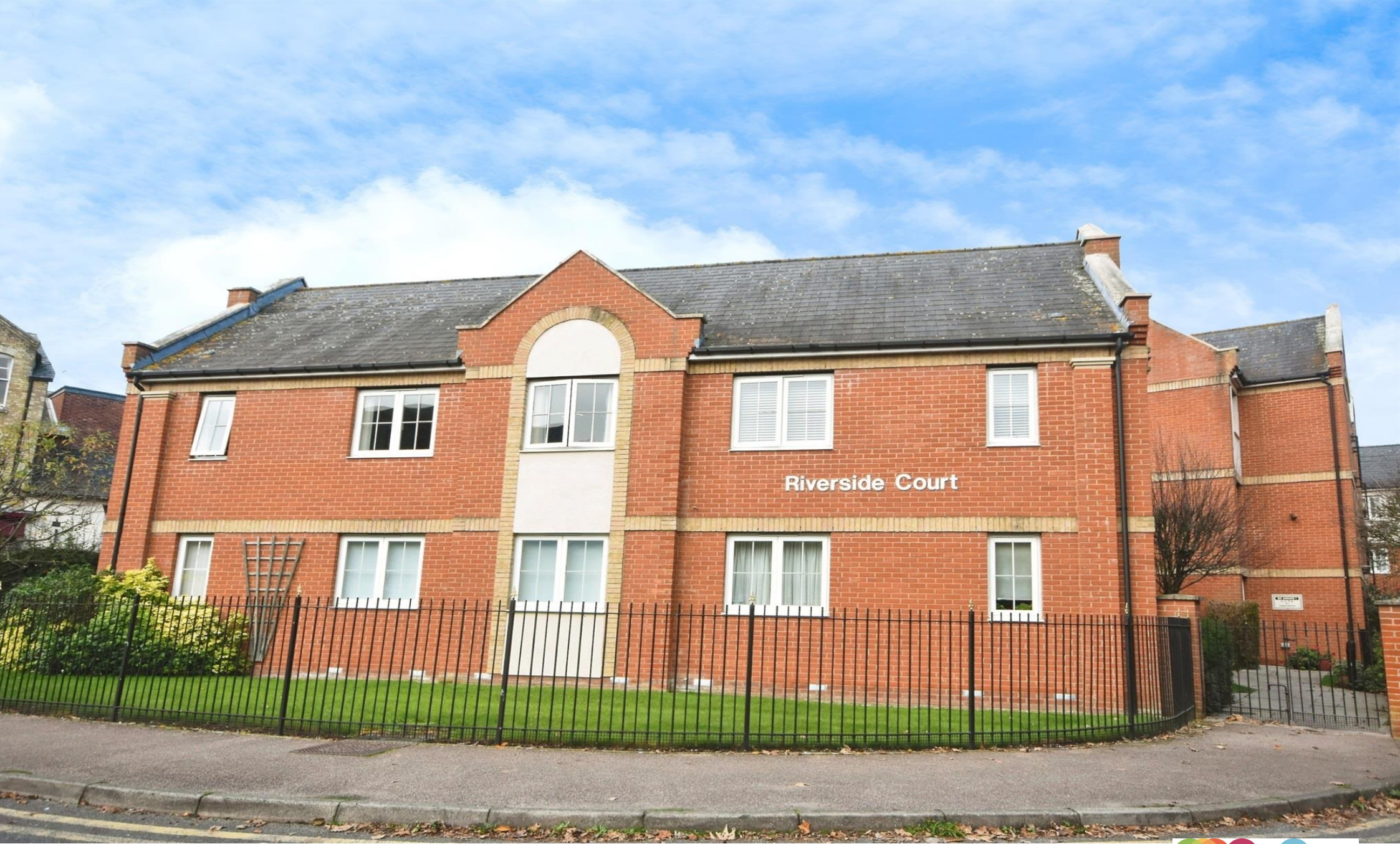
Riverside Court, Rosemary Lane, Halstead, CO9 1FD