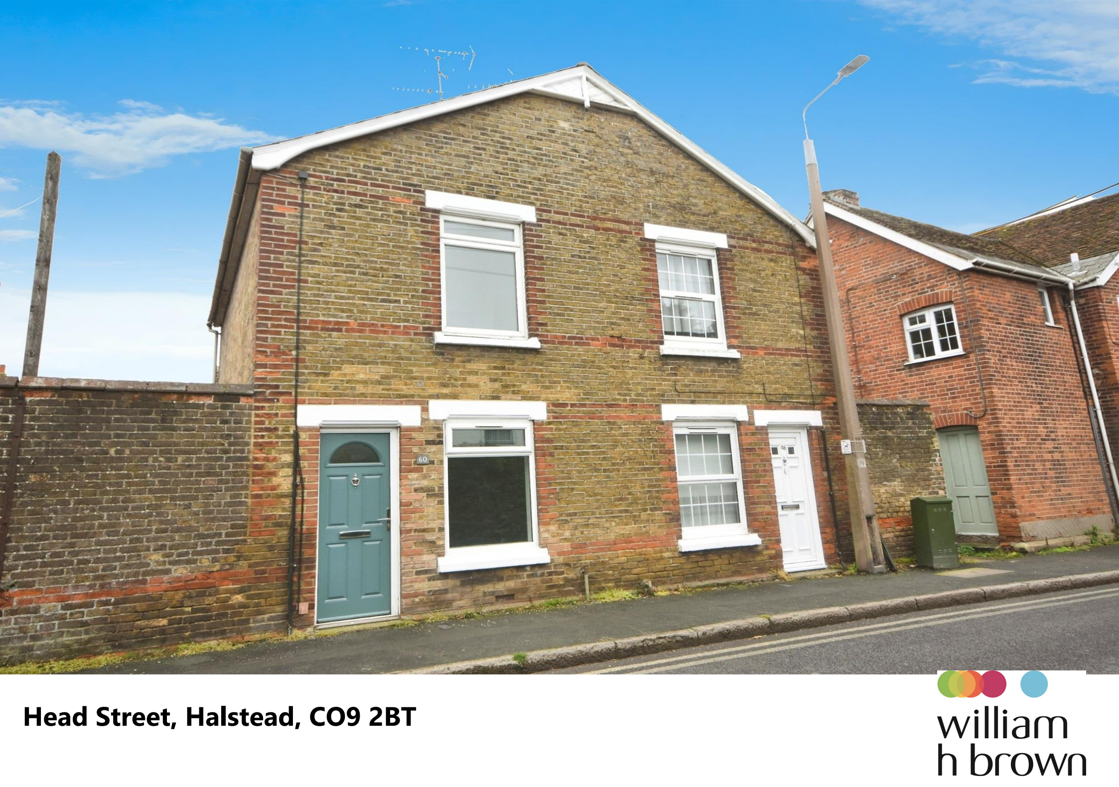
Head Street, Halstead, CO9 2BT