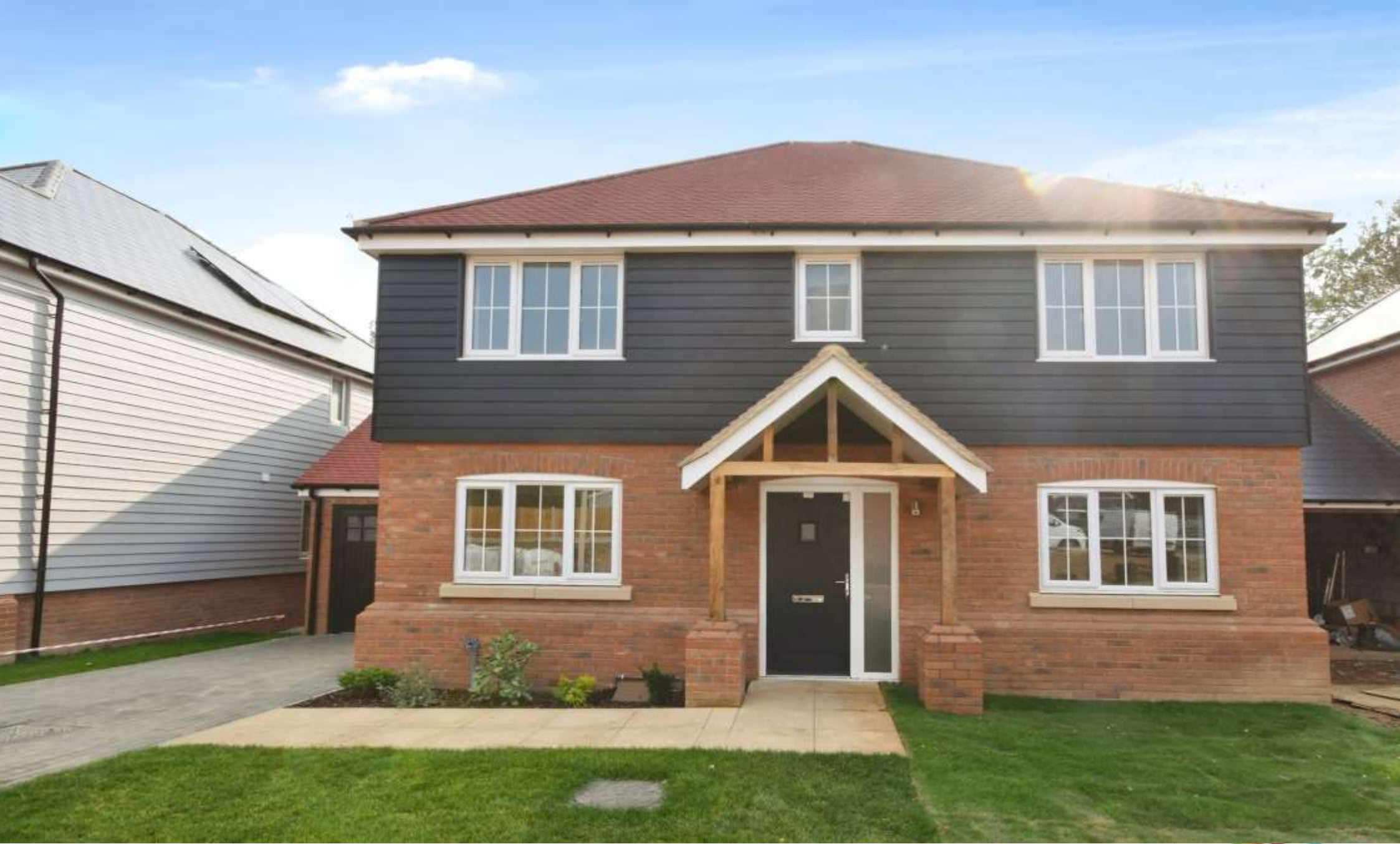
Elizabeth Place, Gosfield, Halstead, CO9 1PT