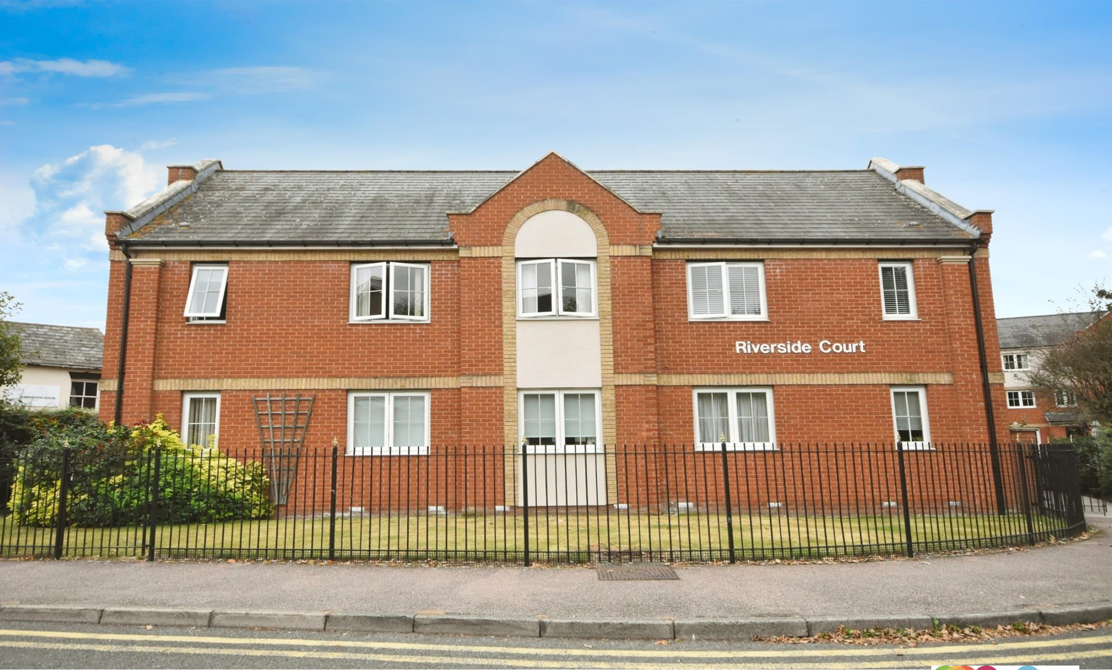
Riverside Court, Rosemary Lane, Halstead, CO9 1FD