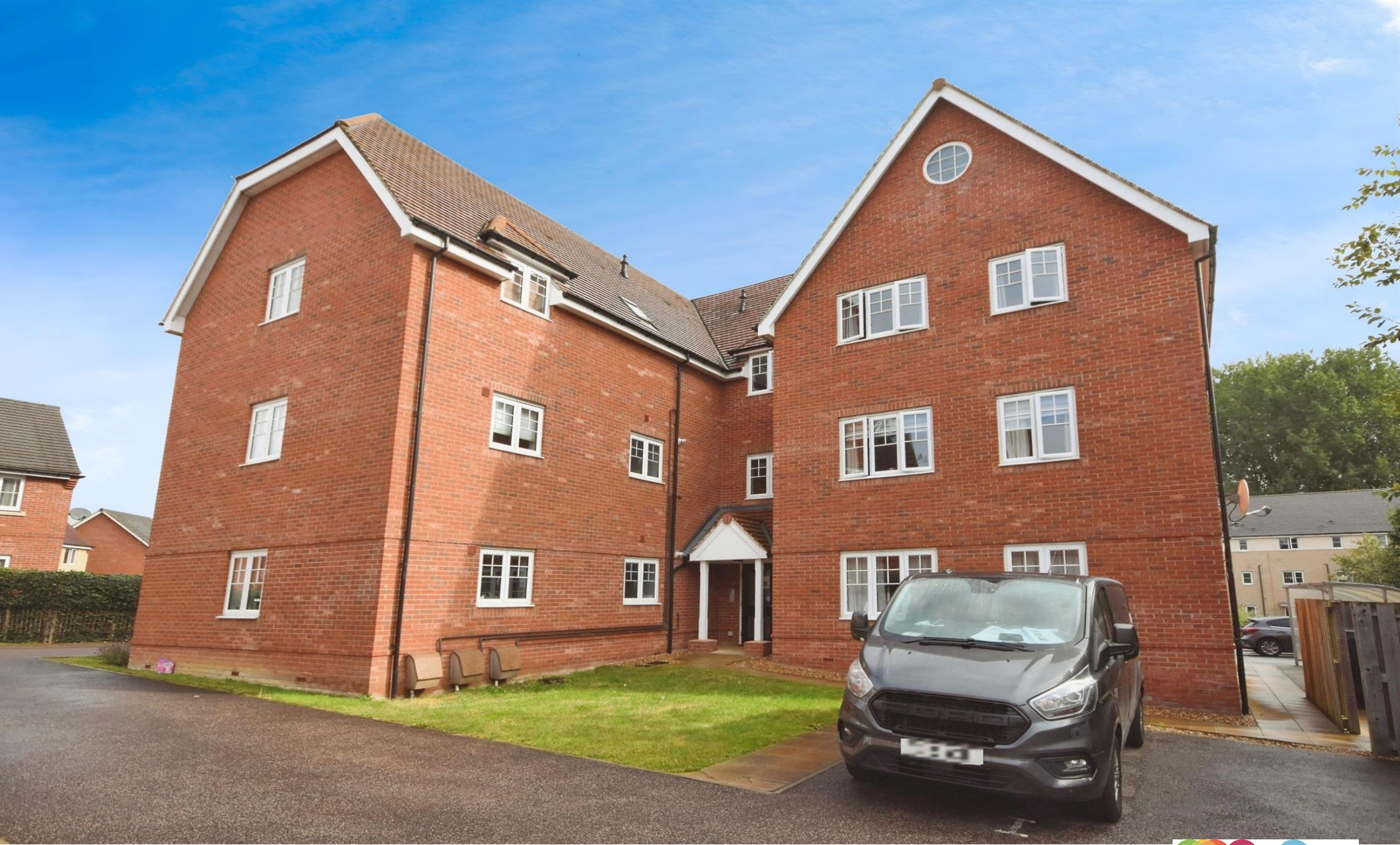
Hogarth Court, Sible Hedingham, Halstead, CO9 3FA