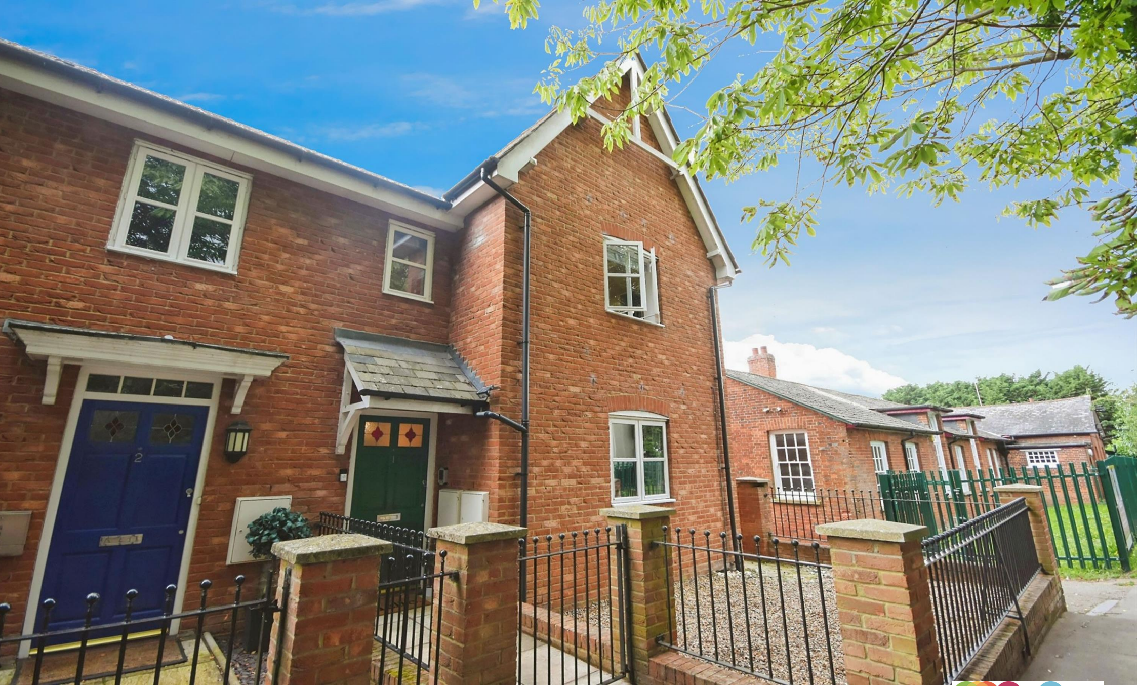
Bronze Court, Parsonage Street, Halstead, CO9 2GY