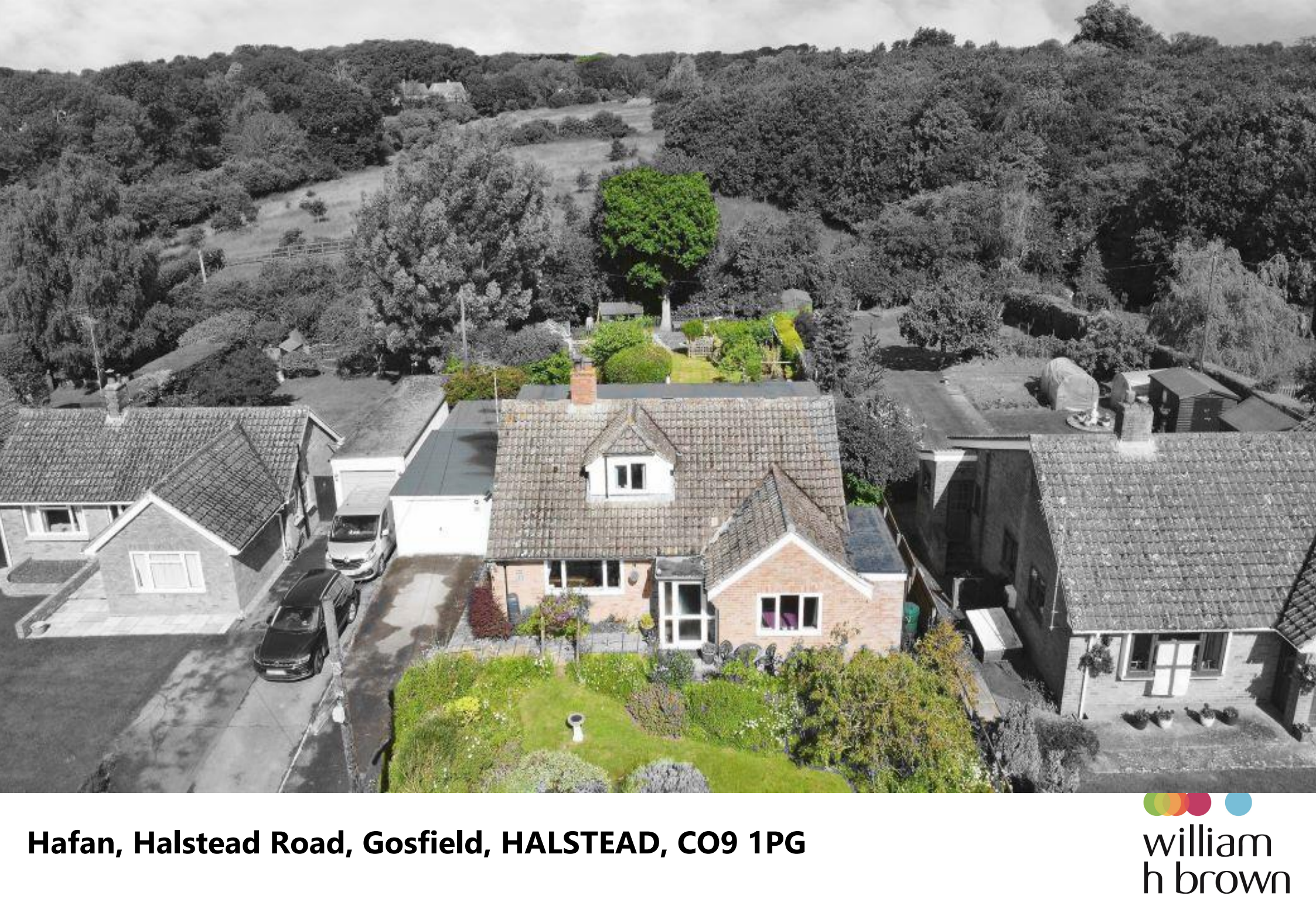
Hafan, Halstead Road, Gosfield, HALSTEAD, CO9 1PG