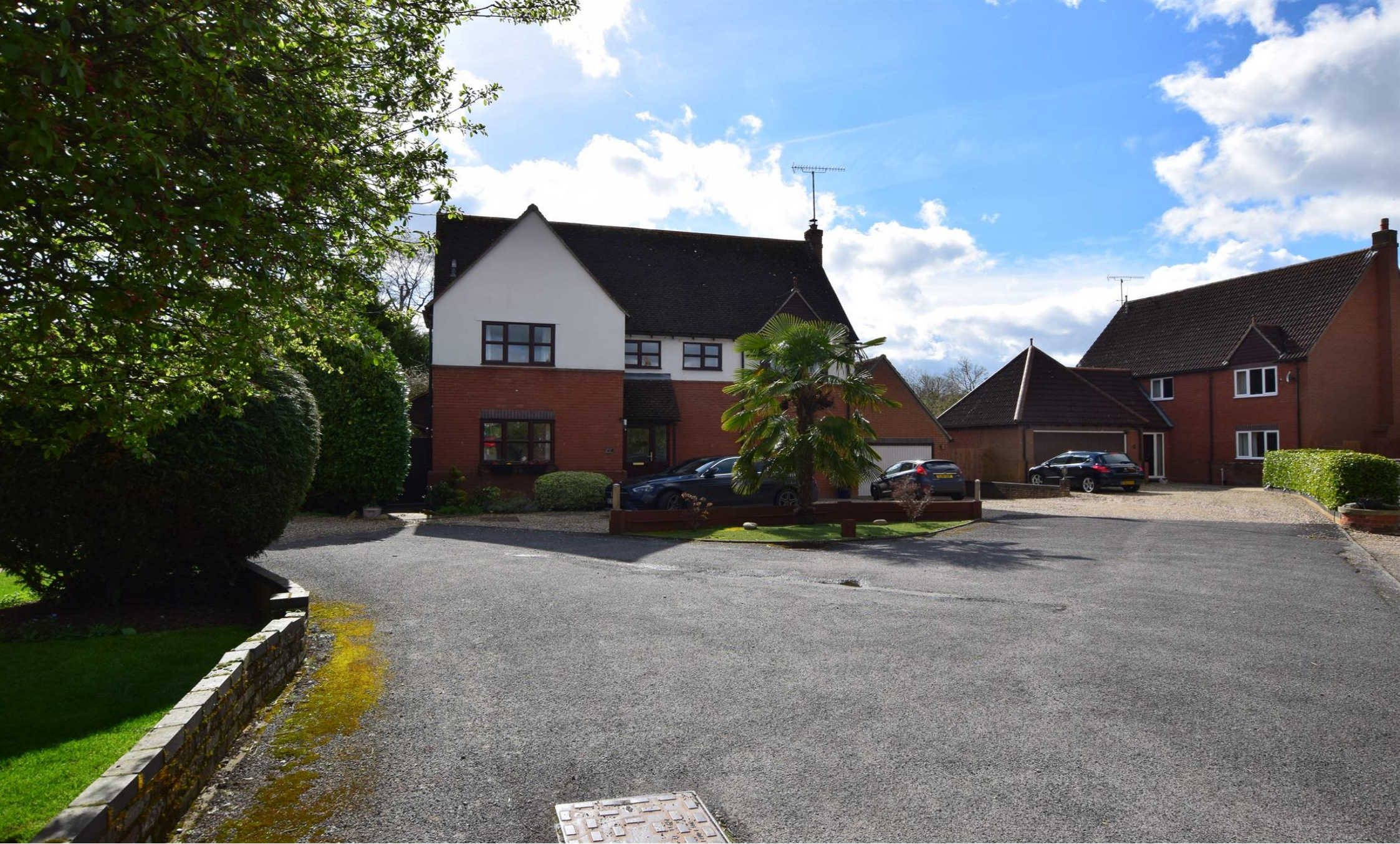
Priory Wood, Castle Hedingham, Halstead, CO9 3DU