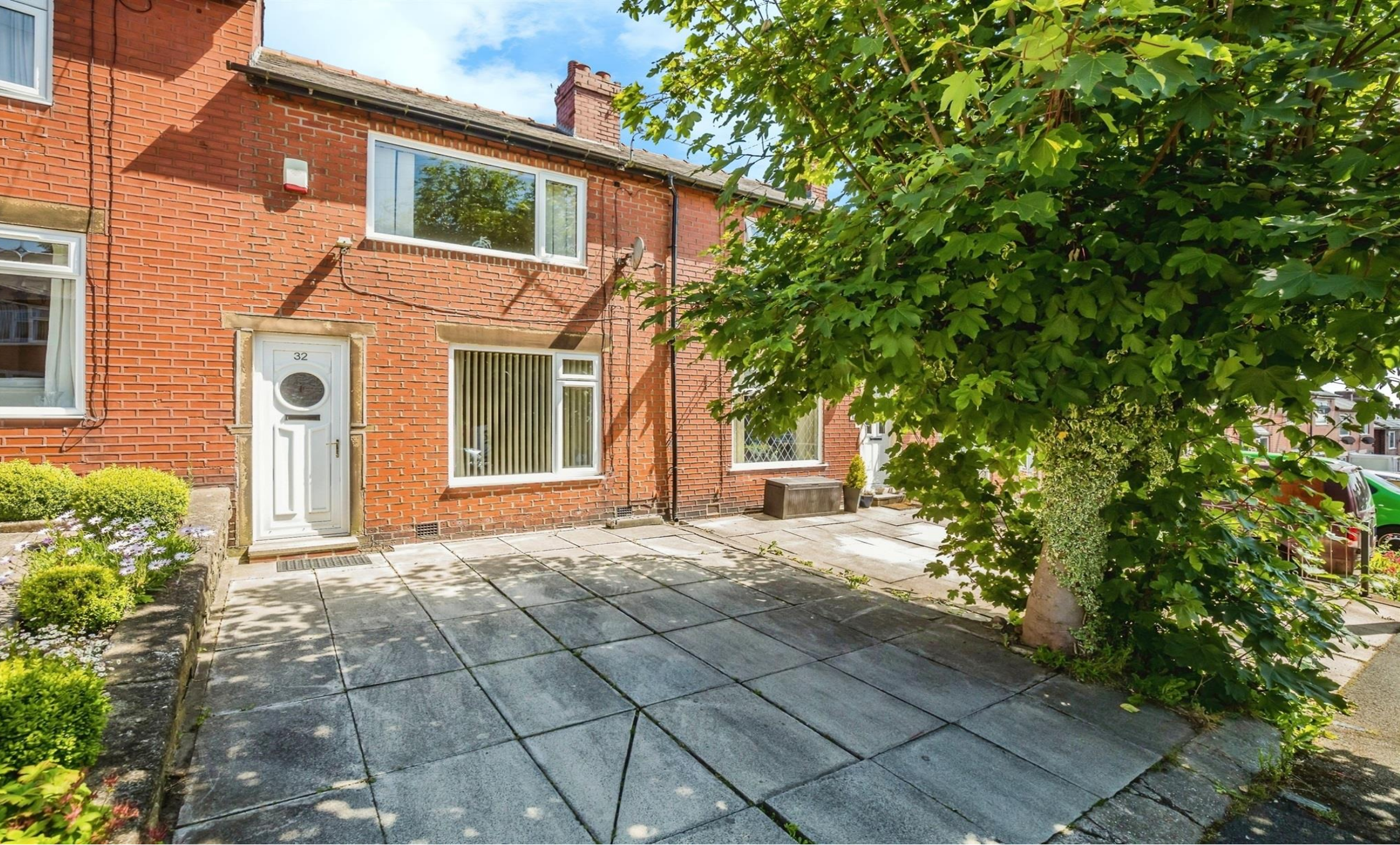
Harewood Avenue, Halifax HX2 0LU