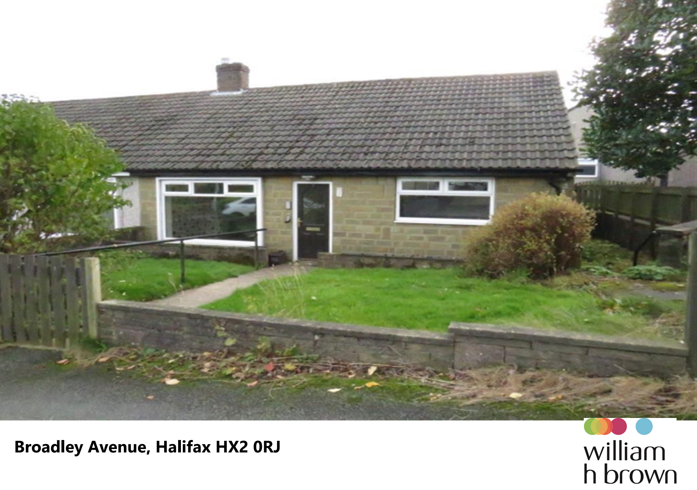
Broadley Avenue, Halifax HX2 0RJ