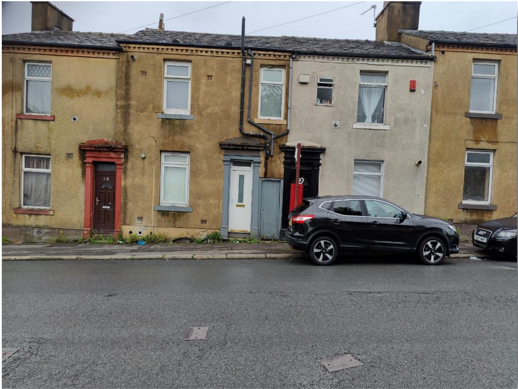
Hanson Lane, Halifax HX1 4SD