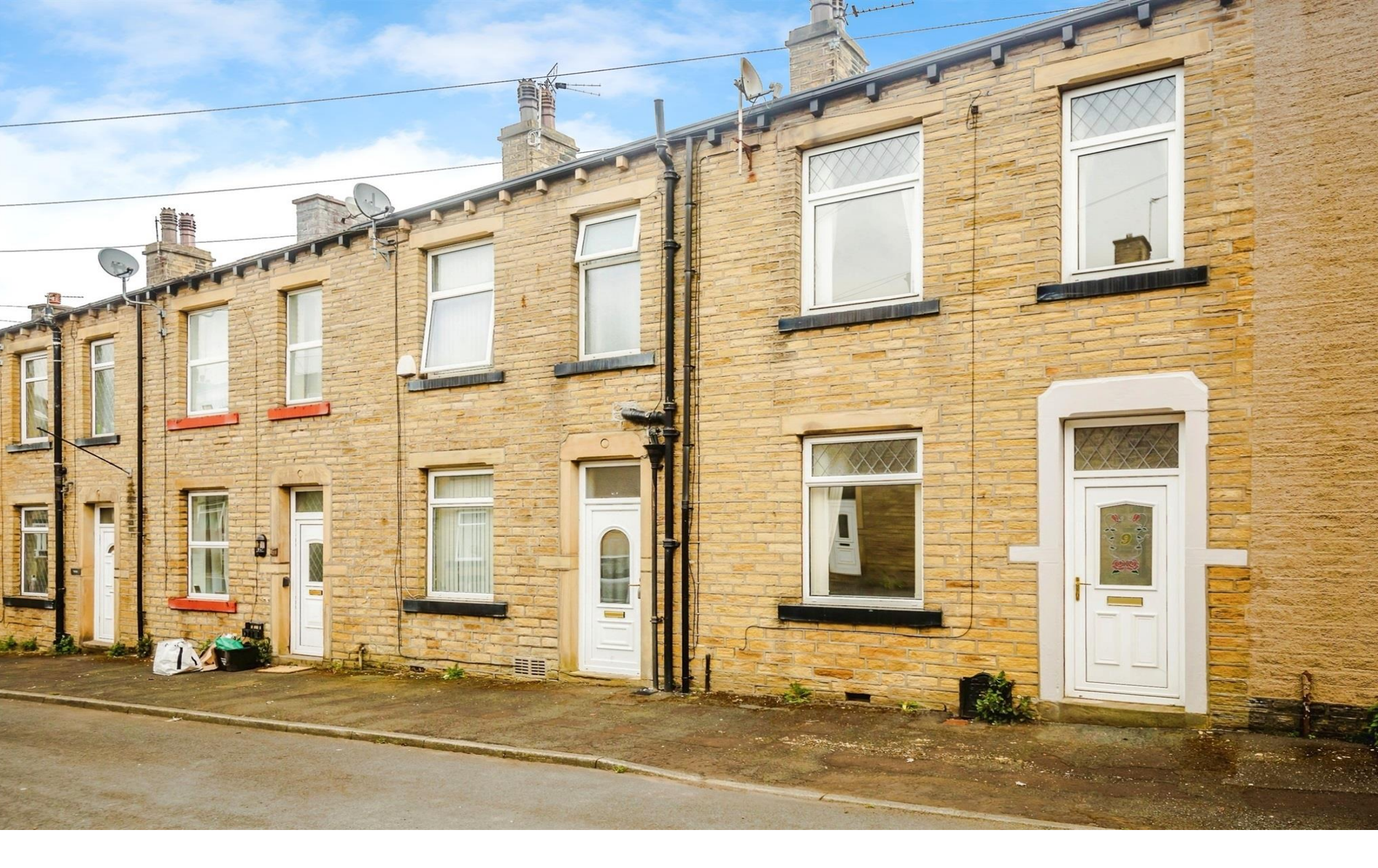
Ruskin Terrace, Halifax HX3 5DU