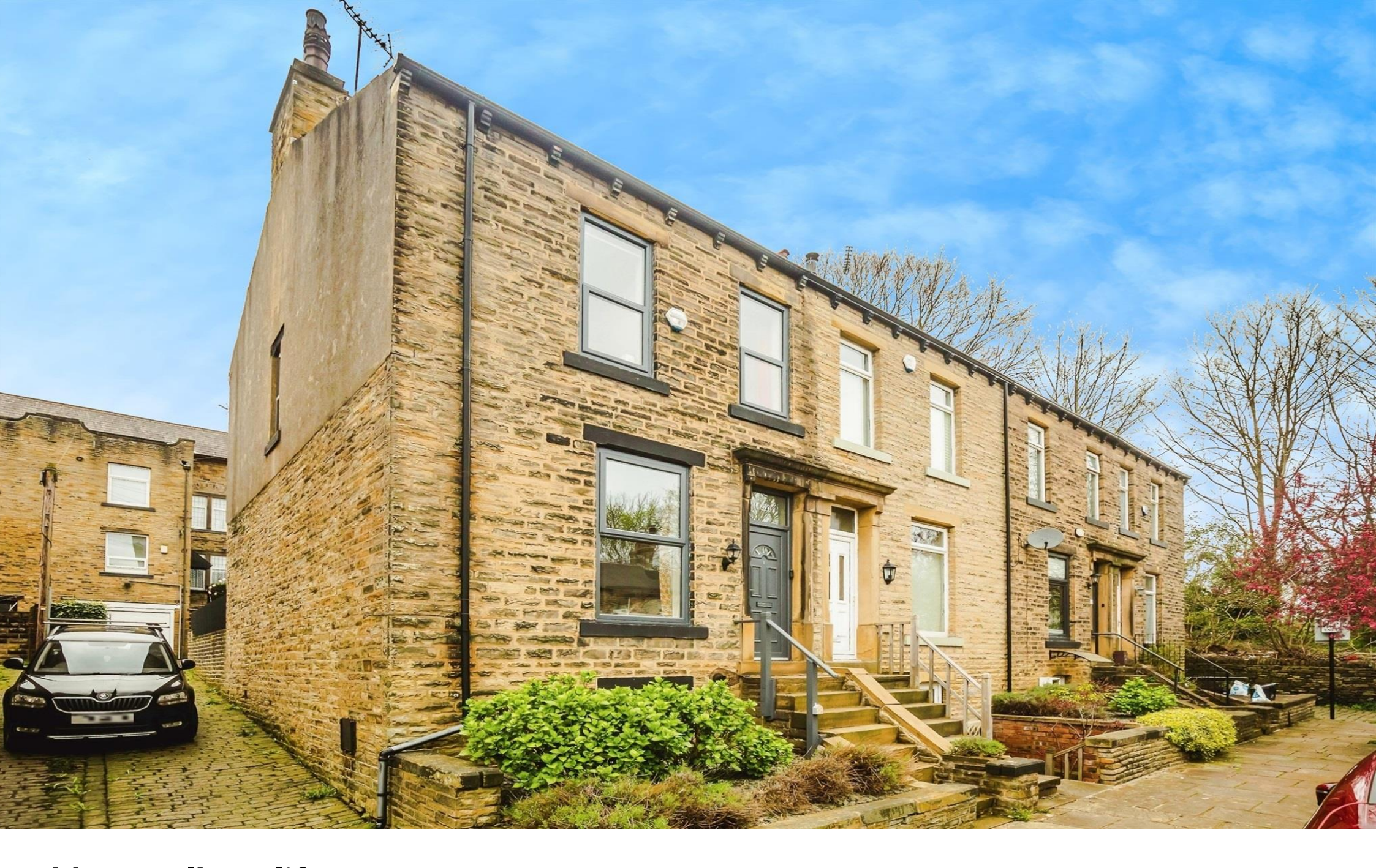
Abbey Walk, Halifax HX3 0AJ