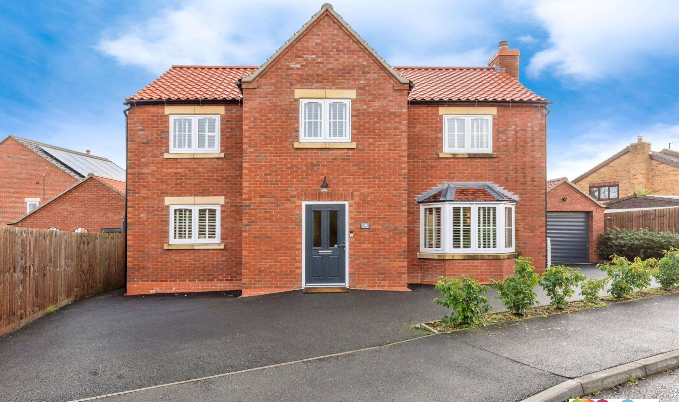
The Chase, Ropsley, Grantham NG33 4AN