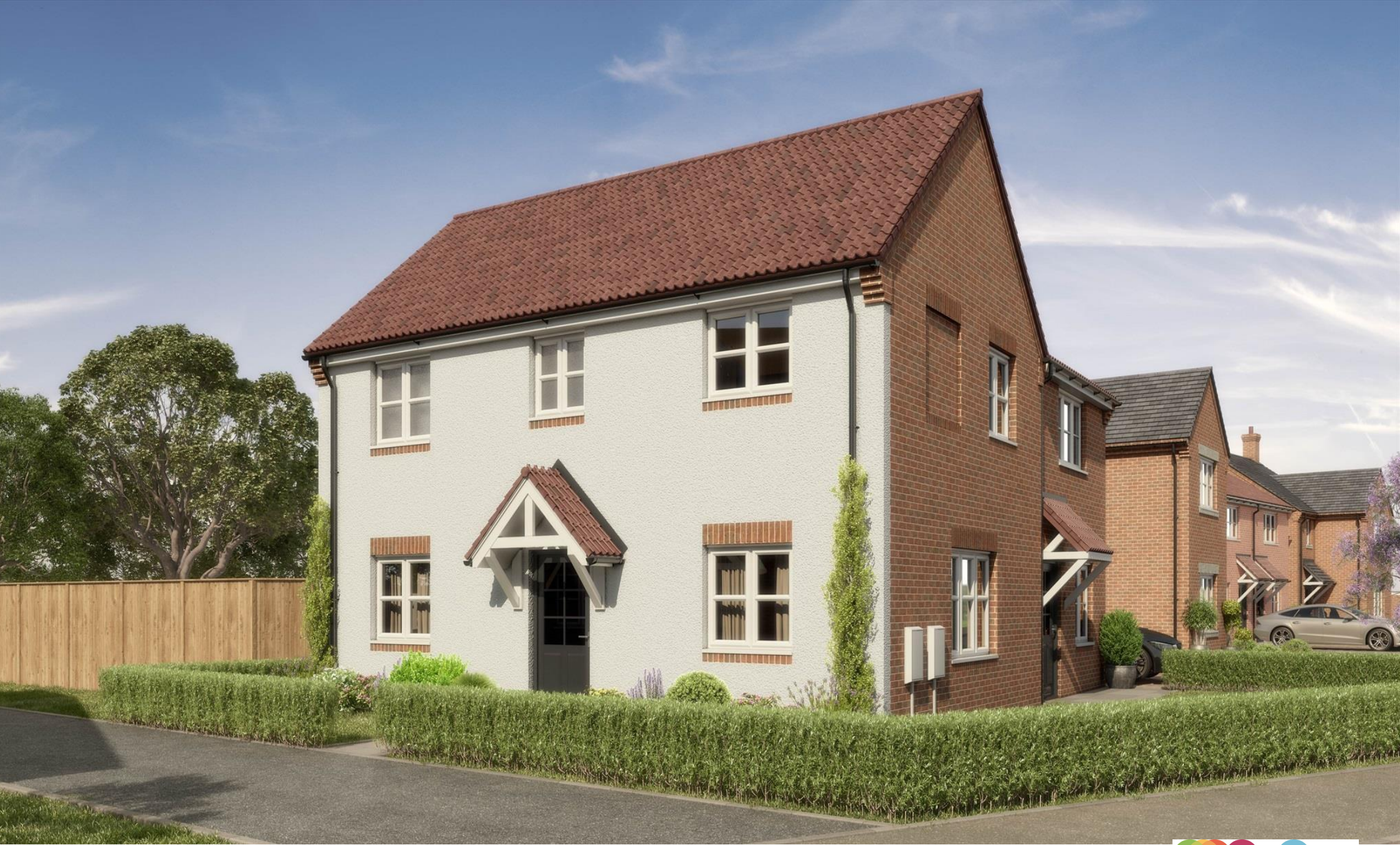
The Lime, Manthorpe Chase, Grantham NG31 8FH