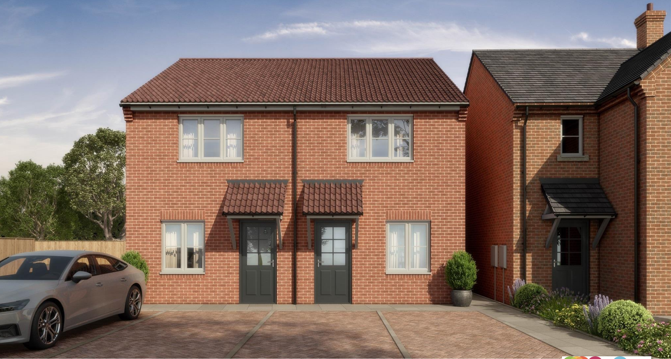
The Oak - Manthorpe Chase, Manthorpe, Grantham NG31 8FH