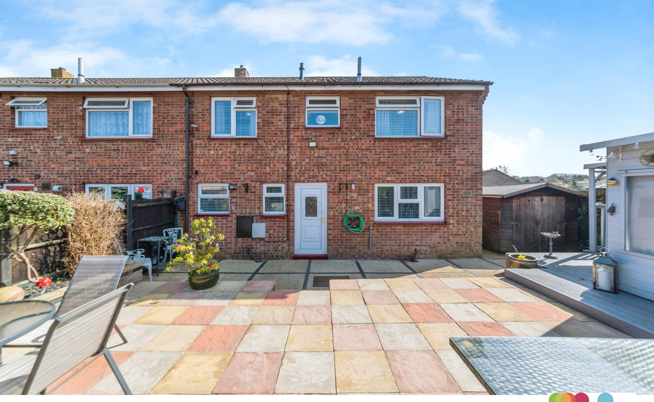
Harby Close, Grantham NG31 7XA