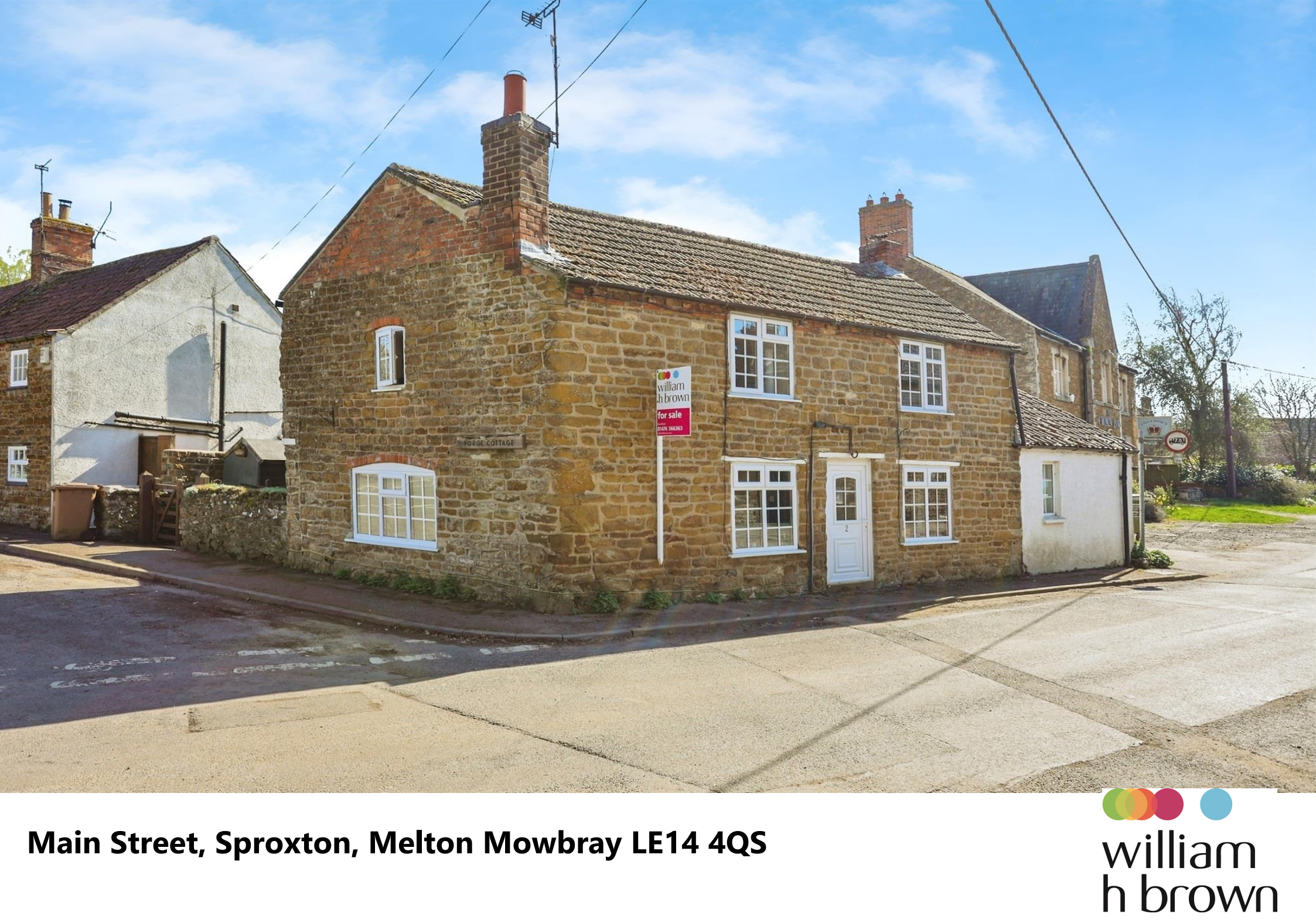
Main Street, Sproxton, Melton Mowbray LE14 4QS