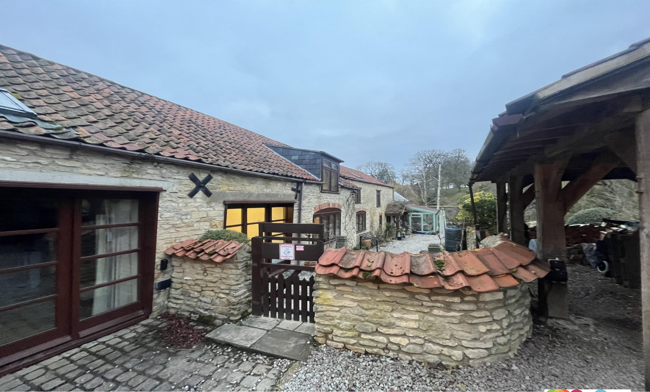
Bishops Coach House Stoke Rochford, Stoke Rochford GRANTHAM NG33 5EB