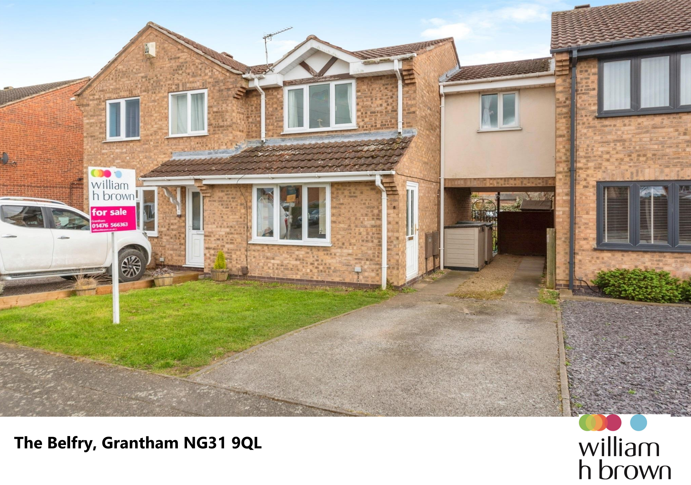
The Belfry, Grantham NG31 9QL