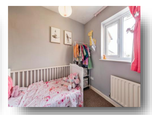
Sunningdale Sunningdale Sunningdale Ascor