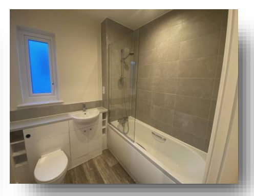
Dysart Rd Dysart Rd Beechan data 62024