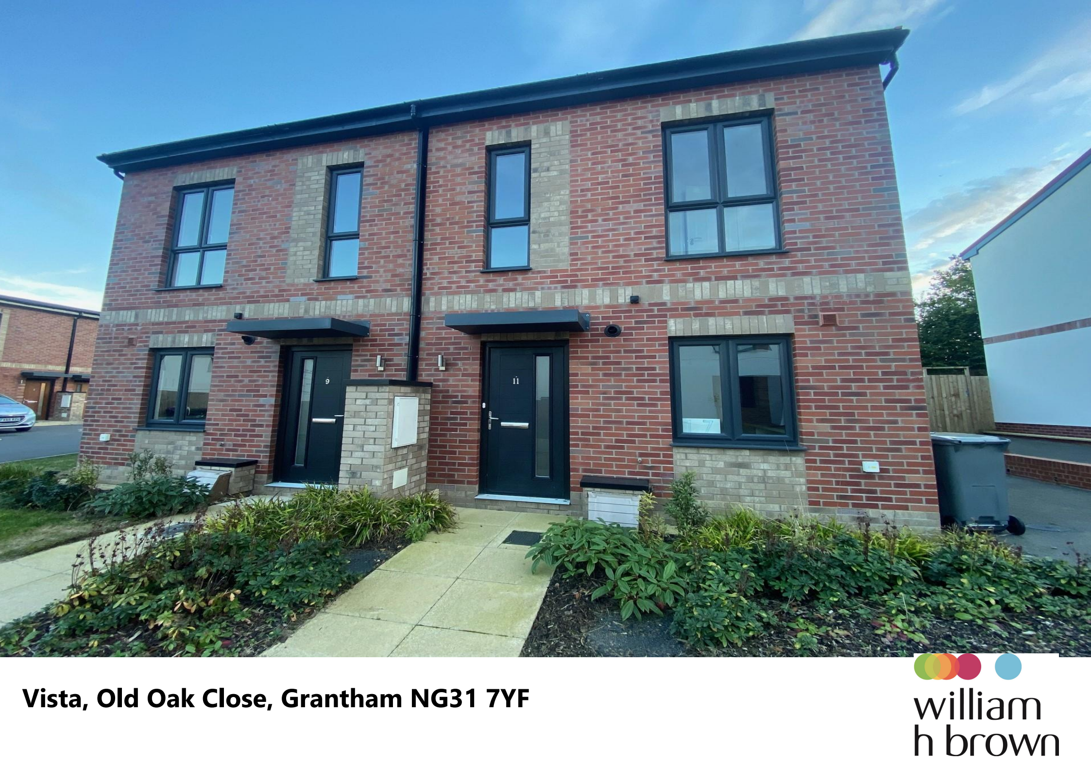
Vista, Old Oak Close, Grantham NG31 7YF