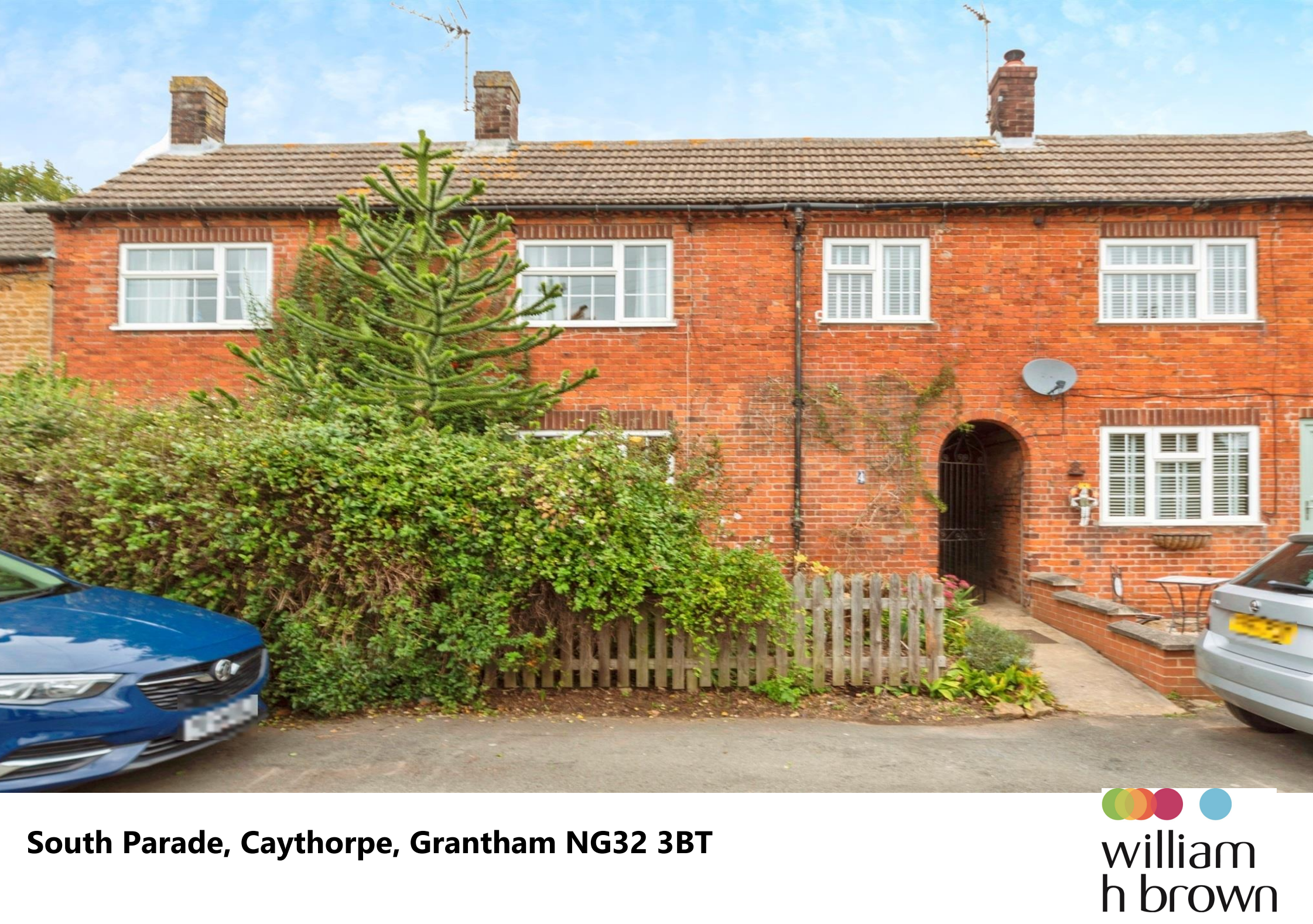
South Parade, Caythorpe, Grantham NG32 3BT