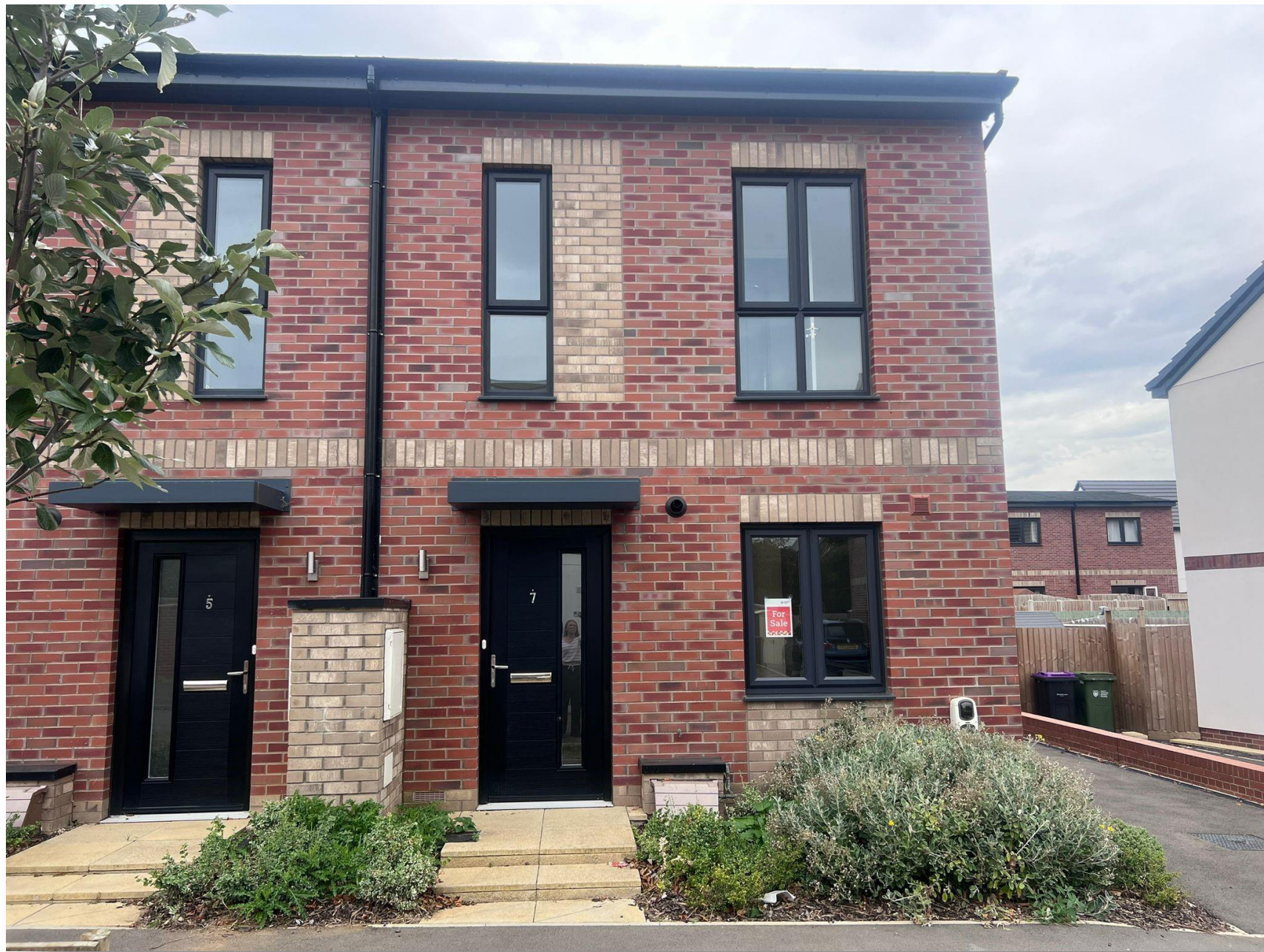
Vista Plot 4, 7 Whinbush Drive, Grantham NG31 7WG