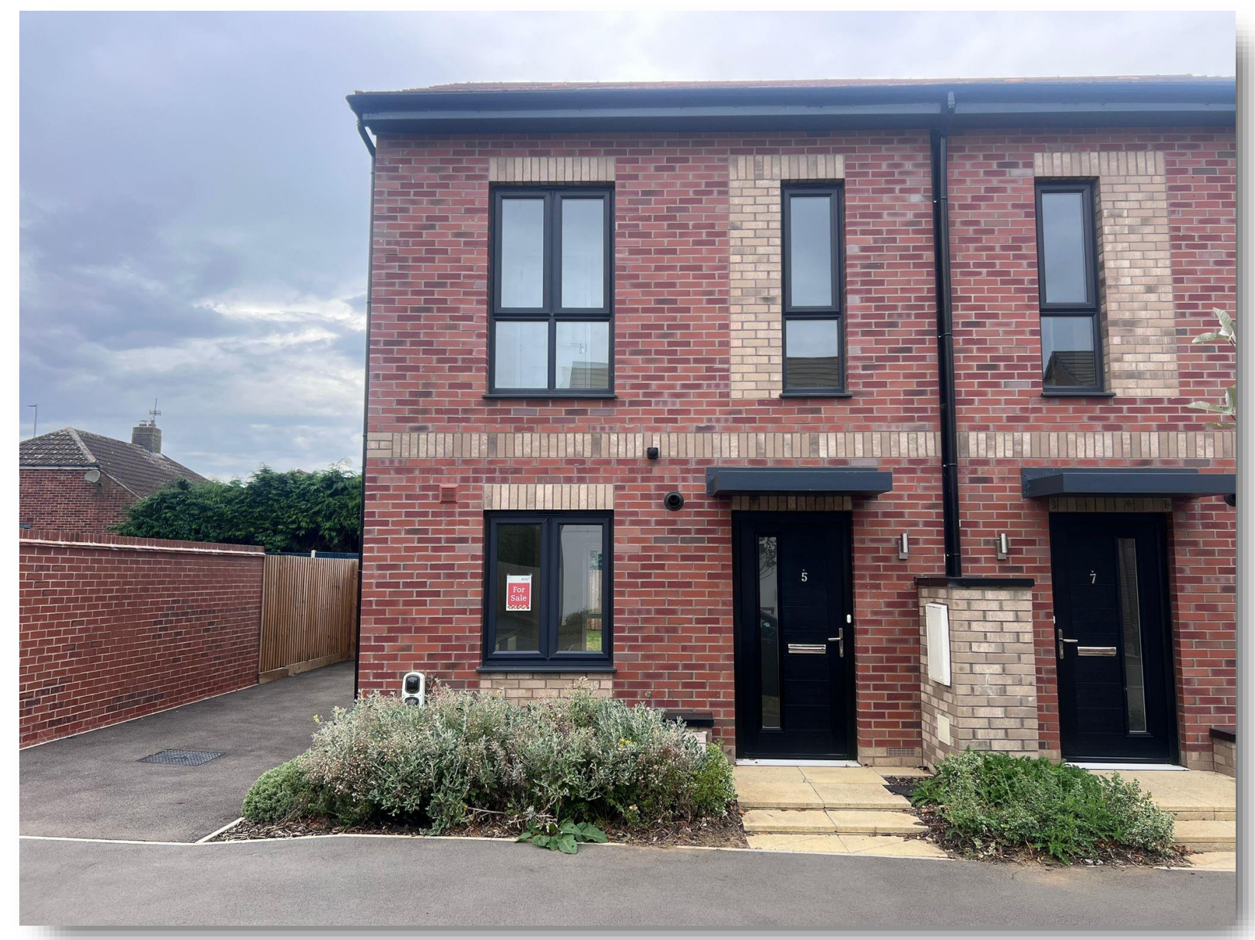
Vista, Whinbush Drive, Grantham NG31 7WG