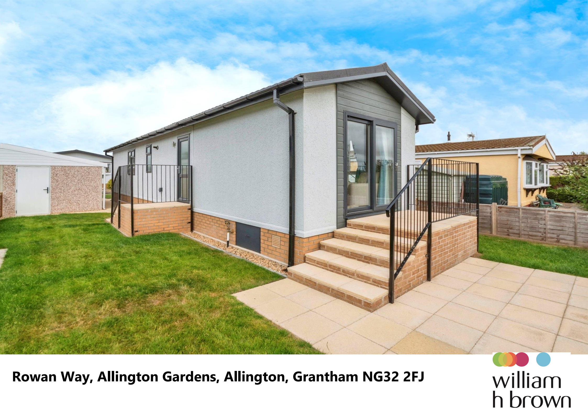
Rowan Way, Allington Gardens, Allington, Grantham NG32 2FJ