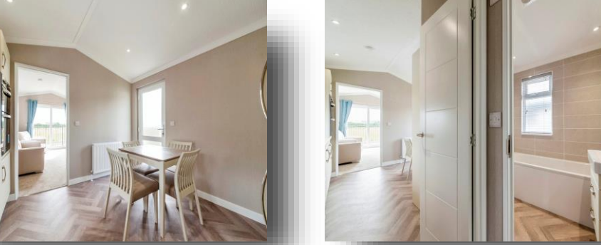
view this property online williamhbrown.co.uk/Property/GST112373