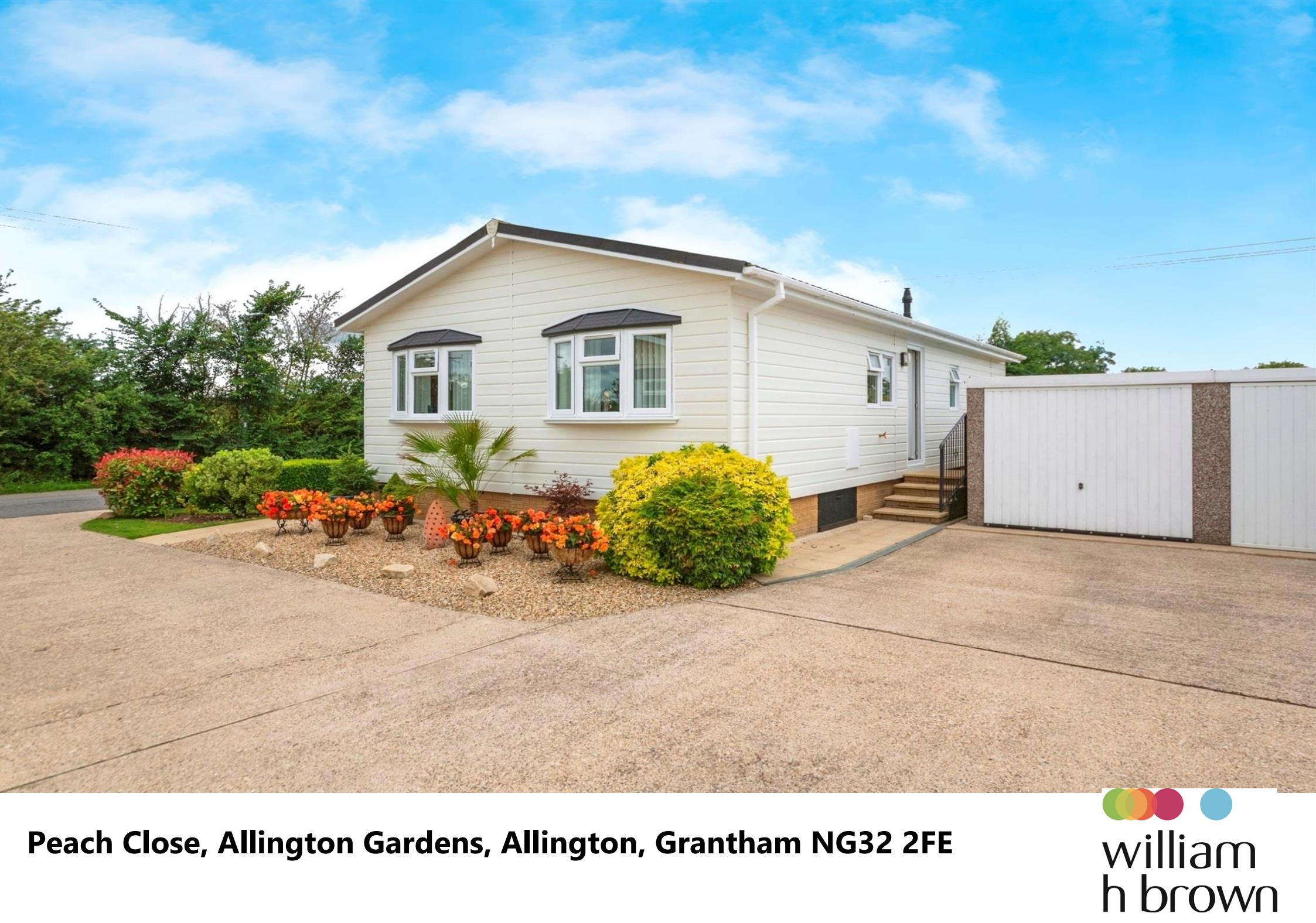
Peach Close, Allington Gardens, Allington, Grantham NG32 2FE