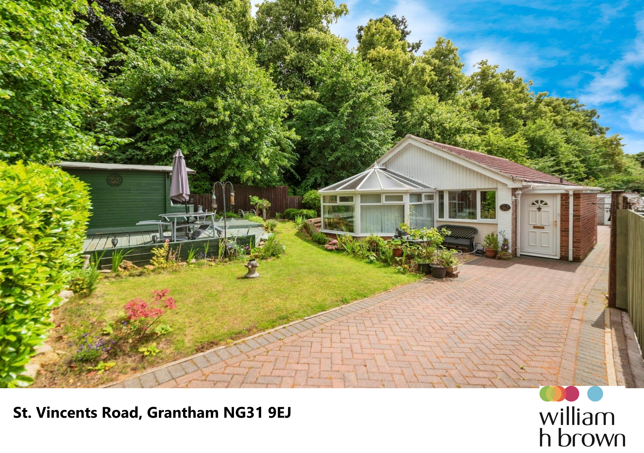
St. Vincents Road, Grantham NG31 9EJ