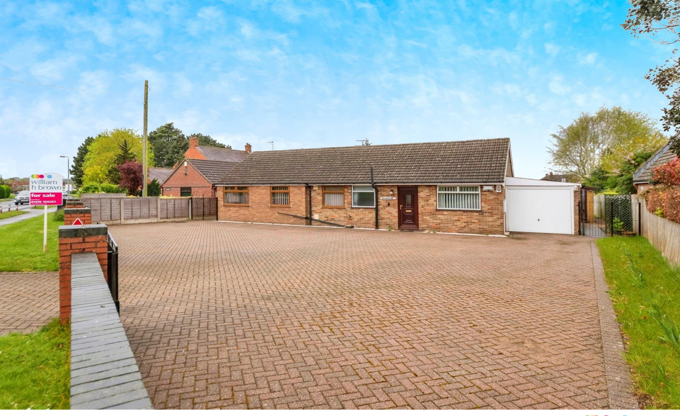
Brierdene, Main Road, Barkston, Grantham NG32 2NH