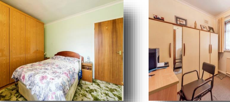
view this property online williamhbrown.co.uk/Property/GST111935