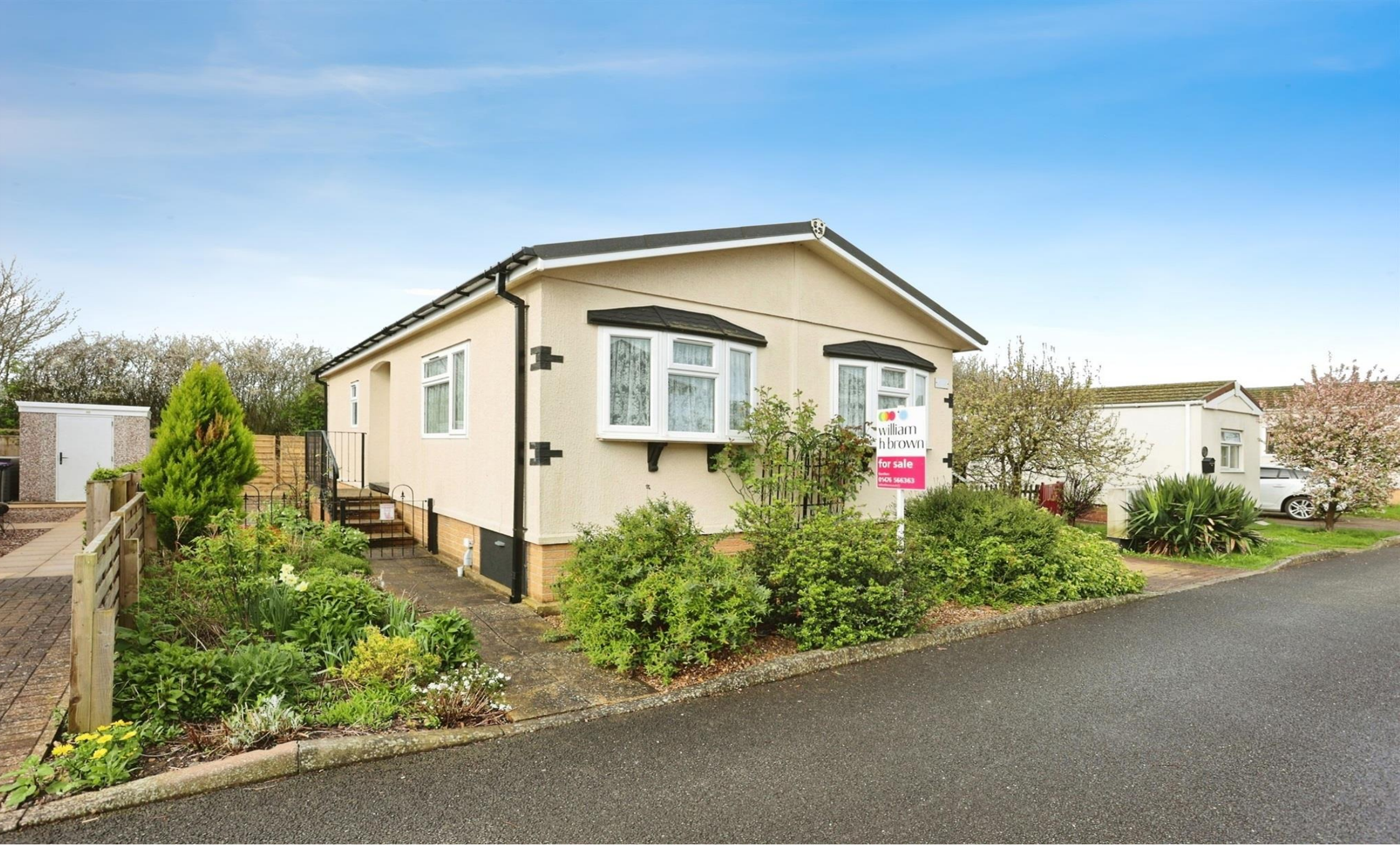
The Green Allington Gardens, Allington Grantham NG32 2FL