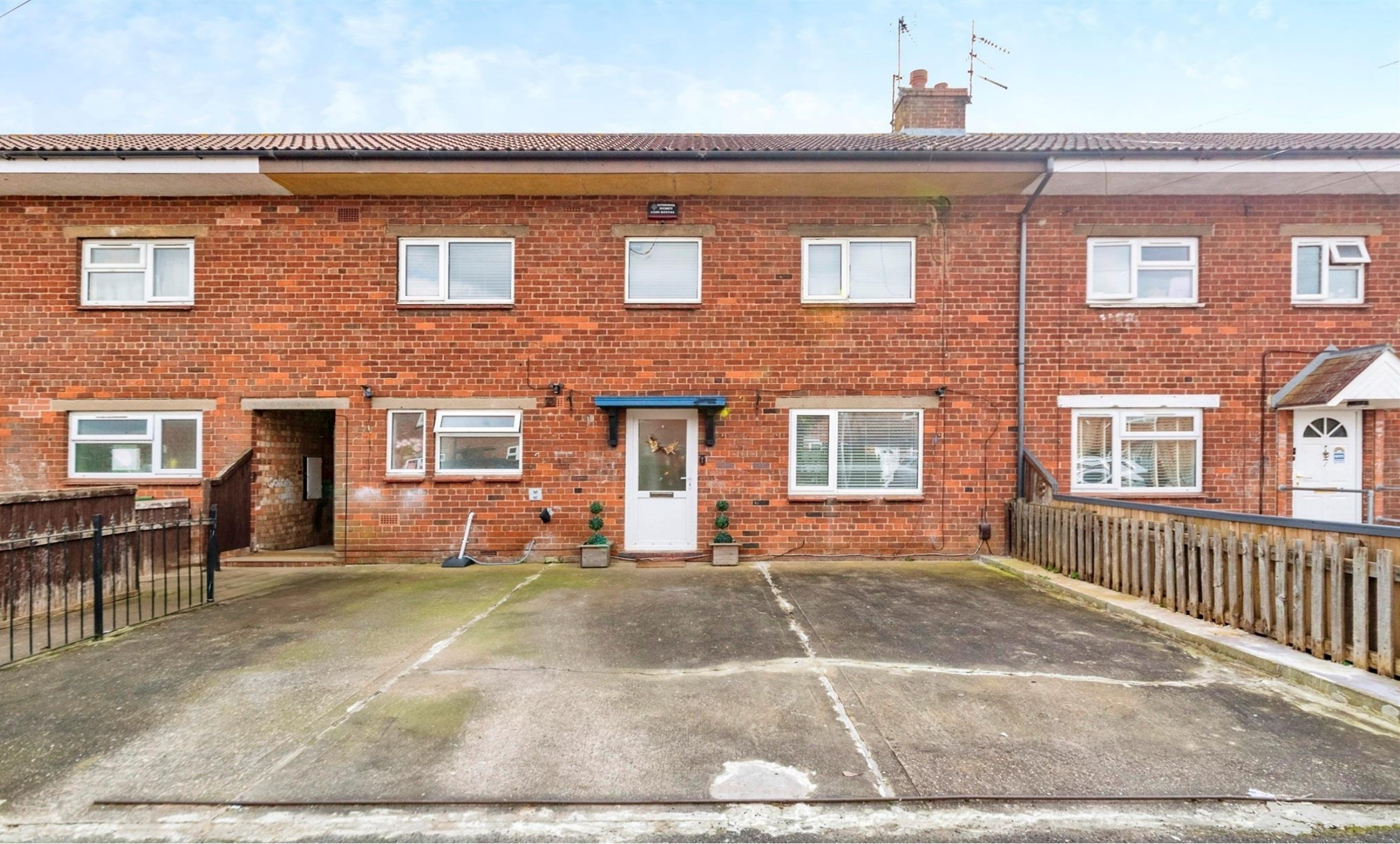
Beechcroft Road, Grantham NG31 7NL